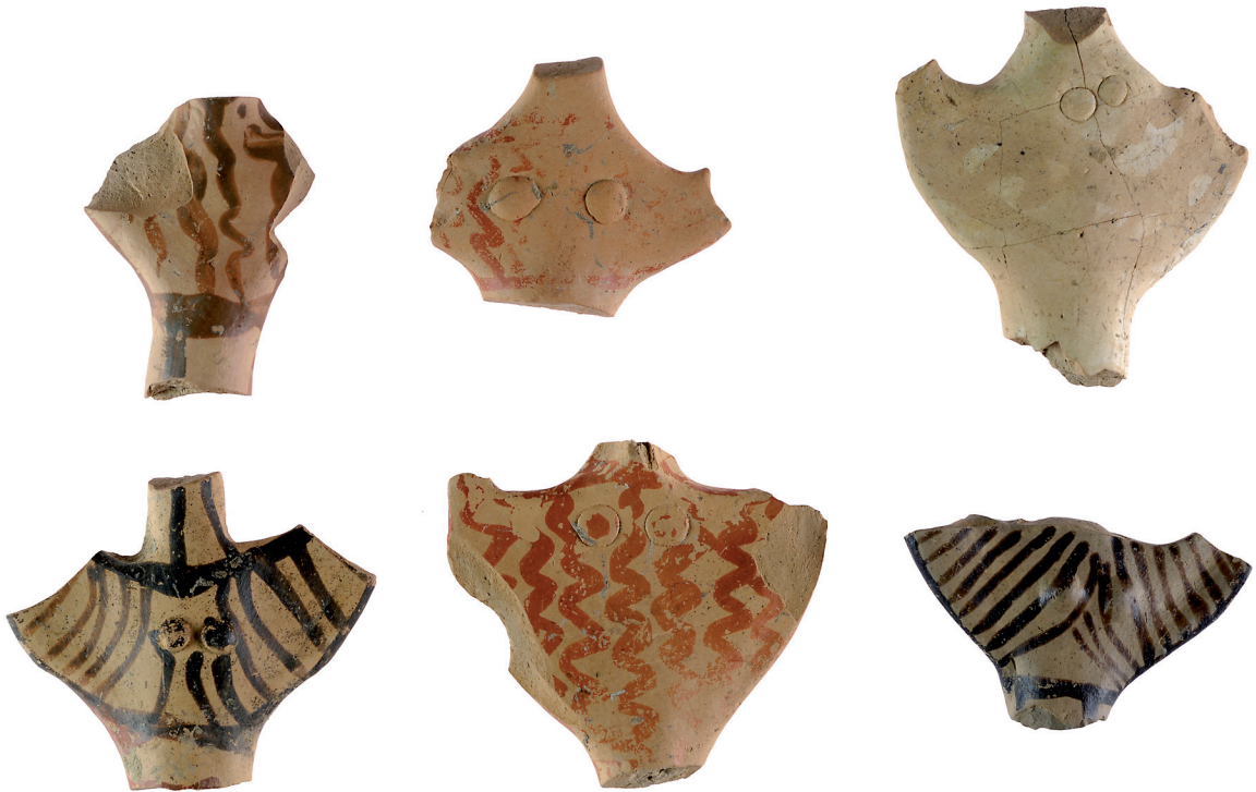
Fig. 4. Fragmentary handmade figurines of type Psi, from the recent excavations.