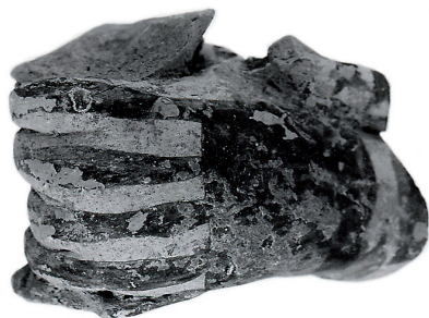
Fig. 2a-b. Hand of a large terracotta figure holding a kylix, from Tsountas excavations.