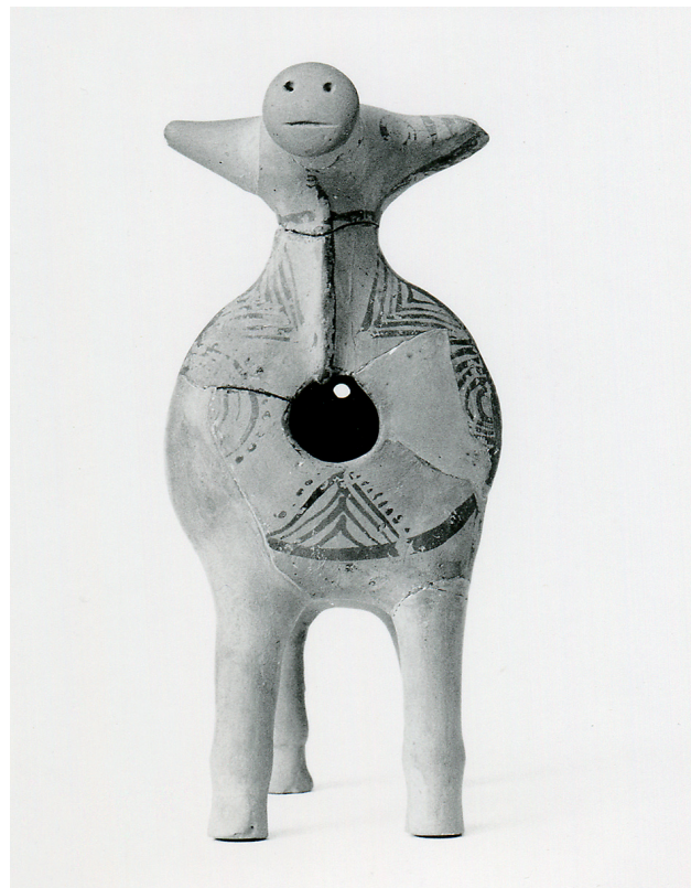
Fig. 9a-b. Wheelmade bovine figure with linear decoration, from Tsountas excavations.

dauros (Apollo Maleatas), 36 Kalapodi 37 and Methana. 38 The ordinary handmade animal figurines could be offerings of lower social classes, most probably from the farmers of the region. The abundance of all these figures and figurines demonstrates that the sanctuary can be included in the category of the great Mycenaean cult centres.