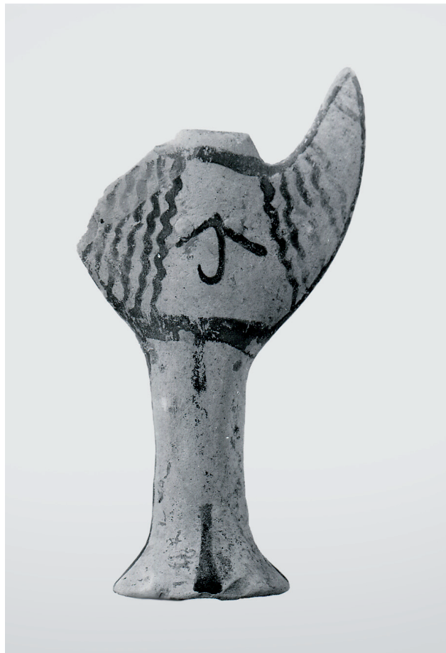
Fig. 3. Handmade figurine of type Psi with elaborate decoration, from Tsountas excavations.

(late 13th-mid 11th centuries BC) and they have affinities with the Late Psi figurines from the Syringes and the Sanctuary on the Lower Citadel of Tiryns. 12 Their decoration is similar to that used for the pottery of these periods.