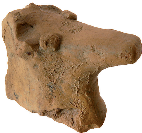
Fig. 8. Solid plain head of a large bovine figure, from the recent excavations.

lished in Late Helladic IIIB2 (second half of 13th century BC), a little before the demise of the palatial centres in the Mainland, and continued to prosper during the Post-palatial period throughout the entire Late Helladic IIIC and Submycenaean periods, until some time in the second half of the 11th century BC. Evidence for religious activity is attested by the large number of terracotta human and animal figures and figurines, especially by the two human figures on a much larger scale. The latter evidently served as cult figures in the sanctuary. Large human cult figures have been found in the great Mycenaean sanctuaries, at Mycenae, 30 Tiryns, 31 and Phylakopi on Melos. 32 The large wheelmade animal figures, bovid and equid, constitute a significant group and most probably were offerings to the sanctuary from members of the upper social classes. Animal figures of this type have been found in the sanctuaries at Tiryns, 33 Phylakopi, 34 Kea (Agia Irini, Temple), 35 Epi-