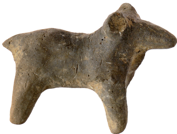
Fig. 6. Handmade plain quadruped figurine, from the recent excavations.

sanctuary of House G at Asine 16 and can likewise be dated to the late 12th century BC. Bird figurines are less common than the animal figurines. The bird, however, is a frequent motif in Creto-Mycenaean iconography (on pottery, seal stones, wall paintings) and often has a religious significance, symbolizing the epiphany of a divinity.