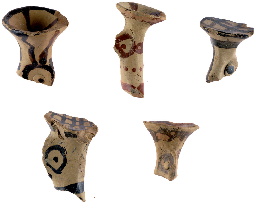
Fig. 5. Polos heads of type Psi figurines, from the recent excavations.