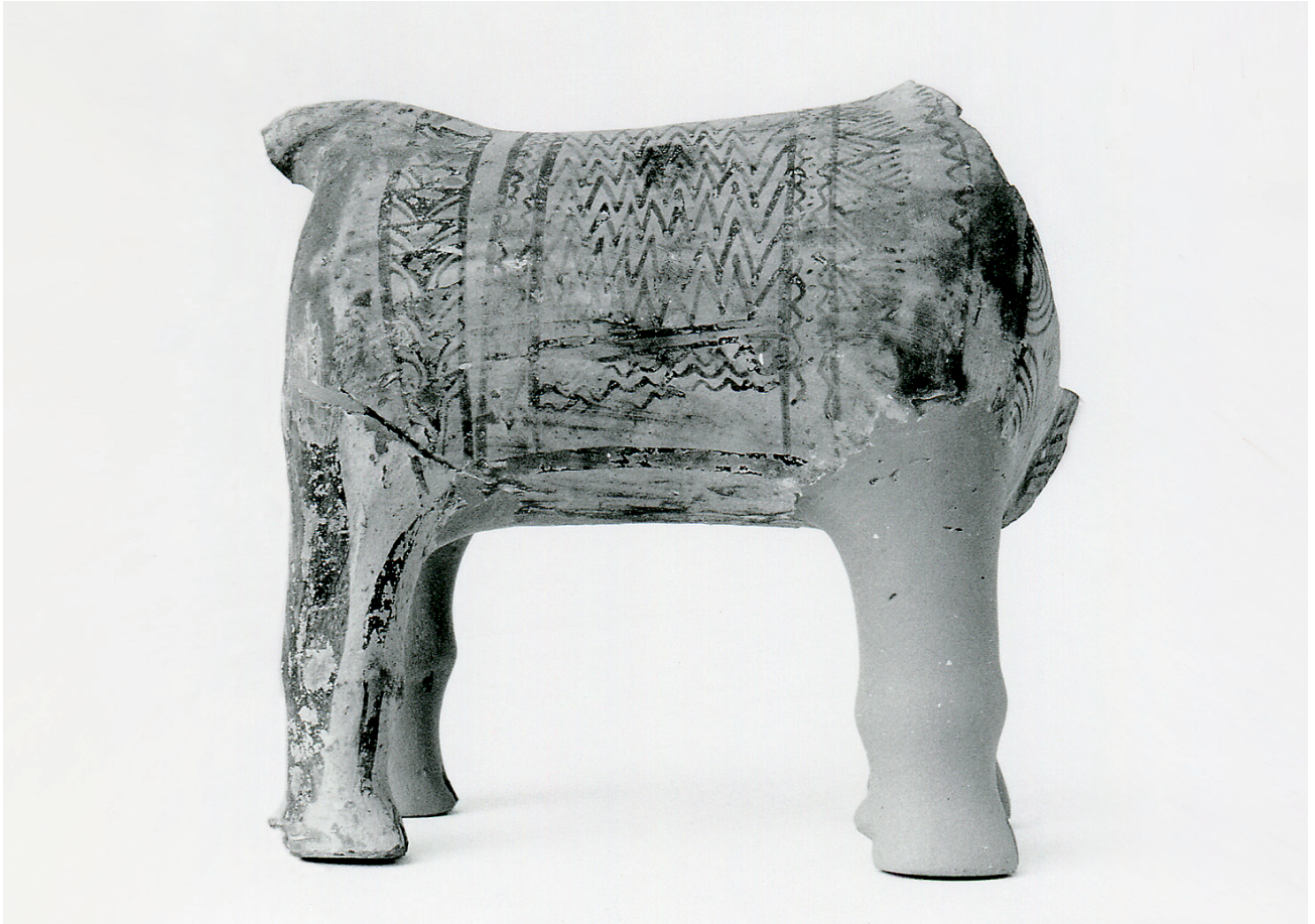
Fig. 7. Wheelmade bull figure with elaborate decoration, from Tsountas excavations.