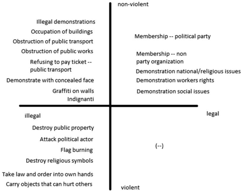
Figure 1: Political Action Items

We first test the assumption of traditional radicalism models that desire for conservation would be associated with right wing ideological preferences (right radicalism) and desire for new experiences would be associated with left wing ideological preferences (left radicalism). We then test our model of values as predictors of political action (illegal, violent and mainstream legal), making a distinction between passive support that signifies intention, and the actualized behavior indicators. We control for ideology emotions, internal and external political efficacy (Craig, Niemi & Silver 1990), trust towards institutions and citizens, political orientations, and demographics.