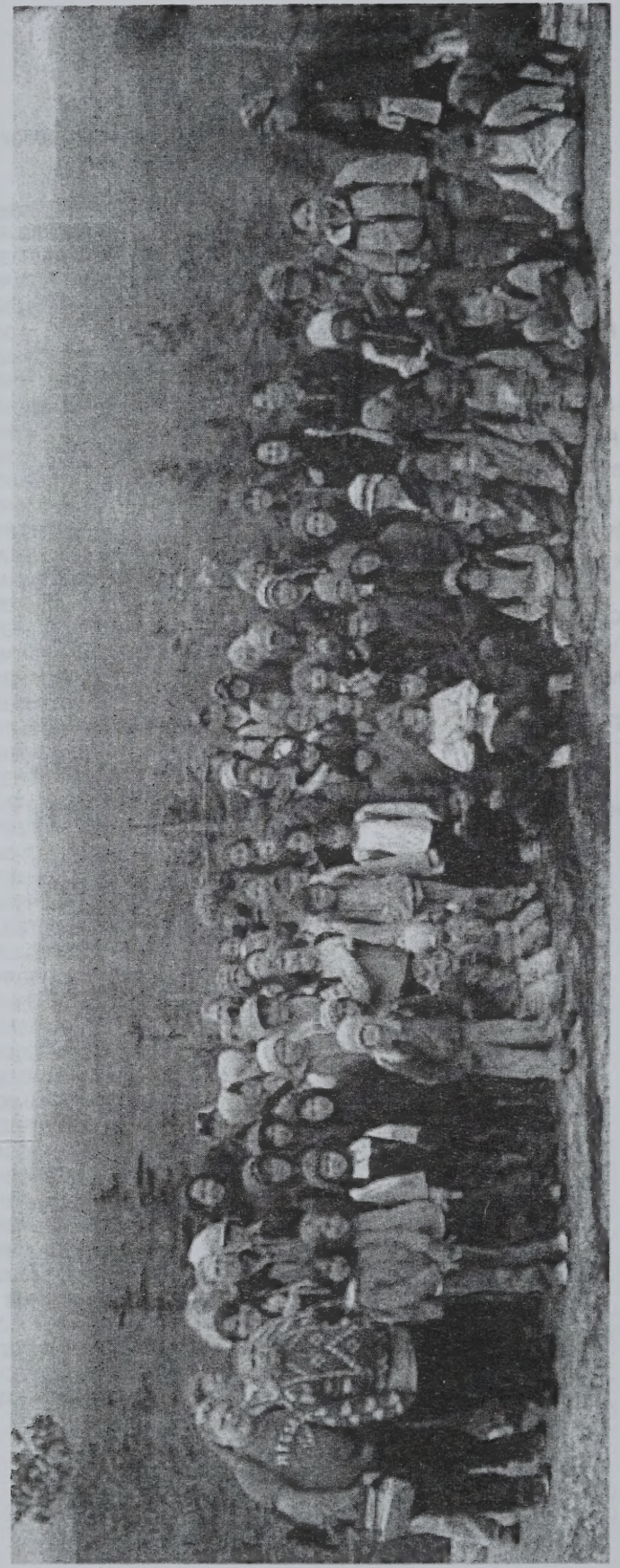
PVS students, teachers and parents on the all school hike