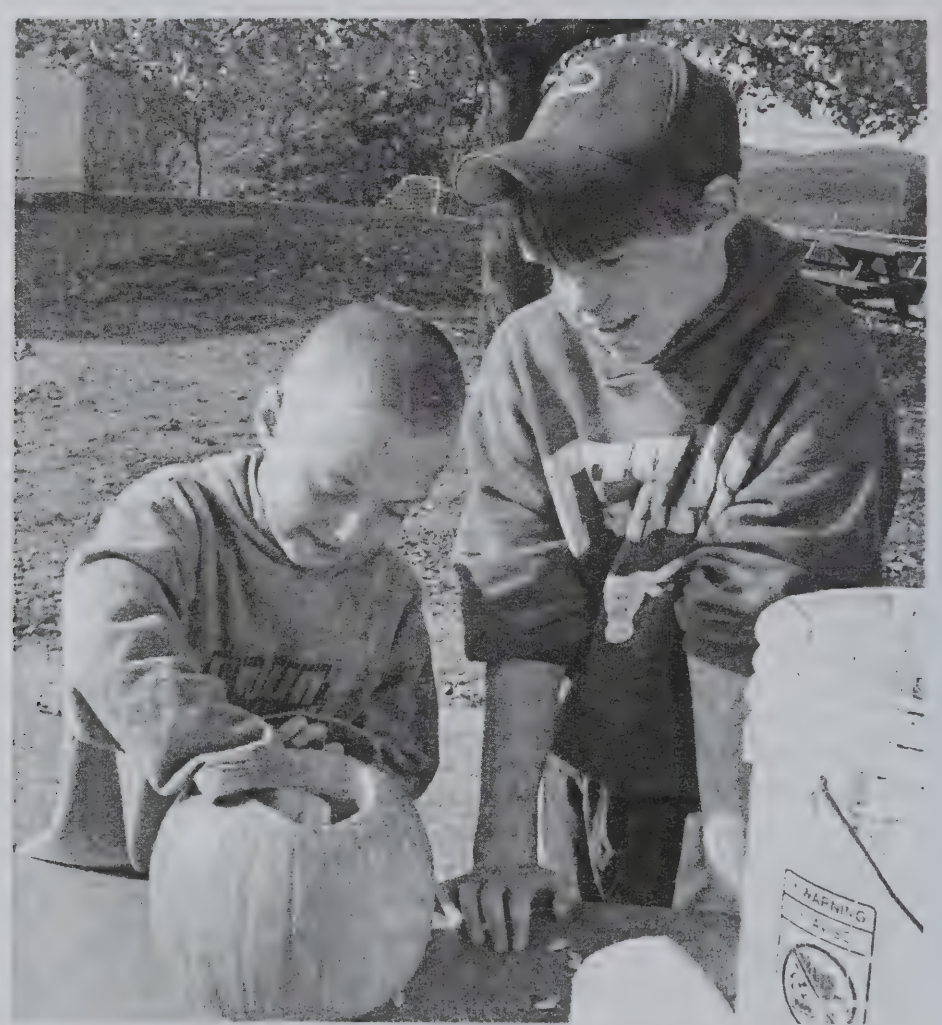
PVS students carving pumpkins for the annual pumpkin lighting at the Plant Pantry