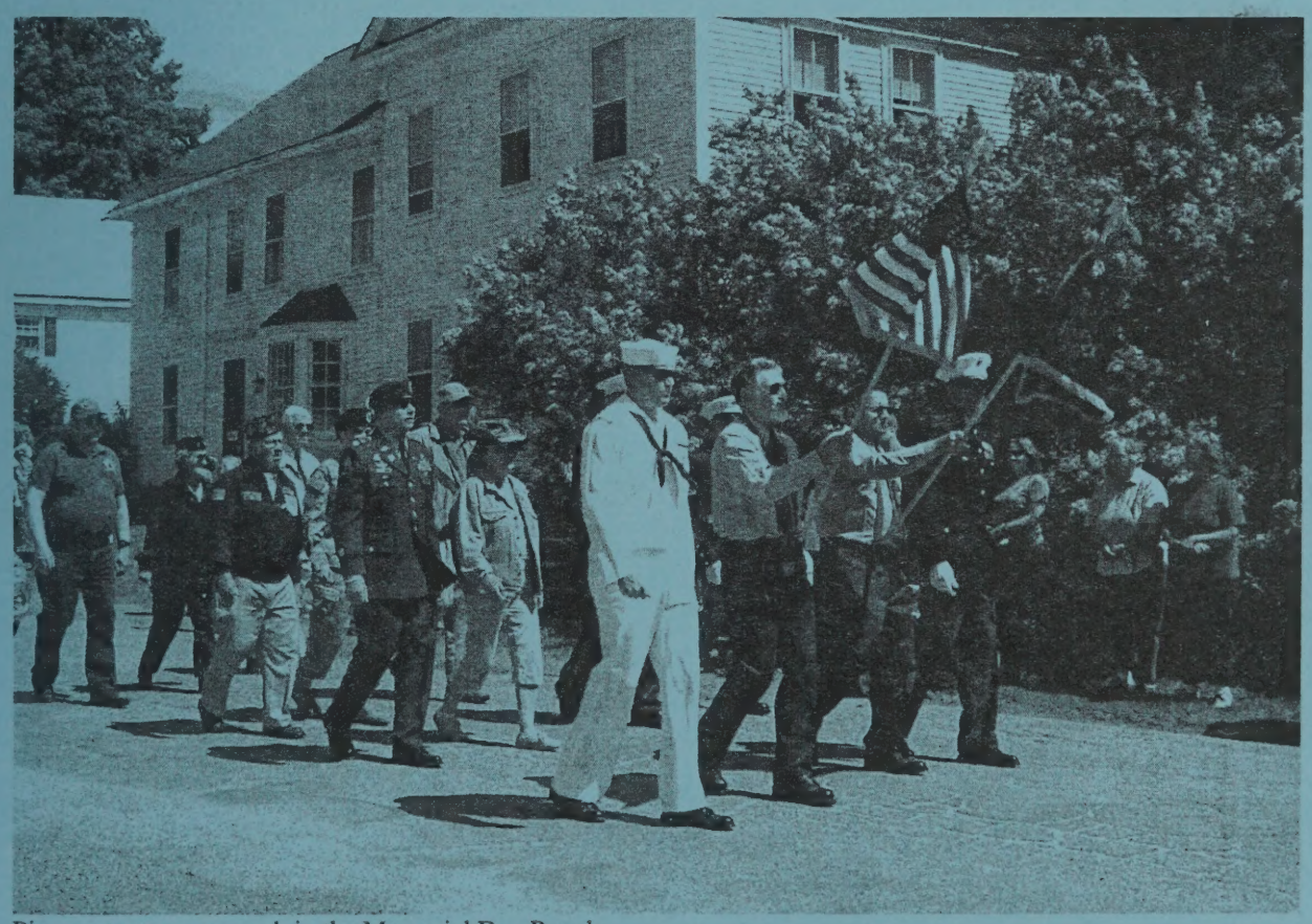
Piermont veterans march in the Memorial Day Parade