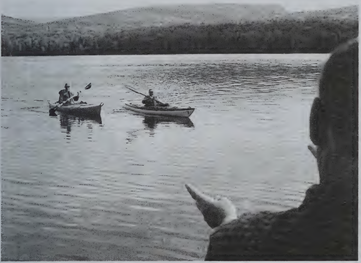
Local kayakers take a trip on Lake Tarleton