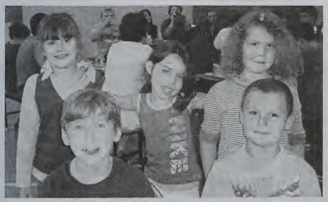
Students from PVS celebrate birthdays for the month of August.