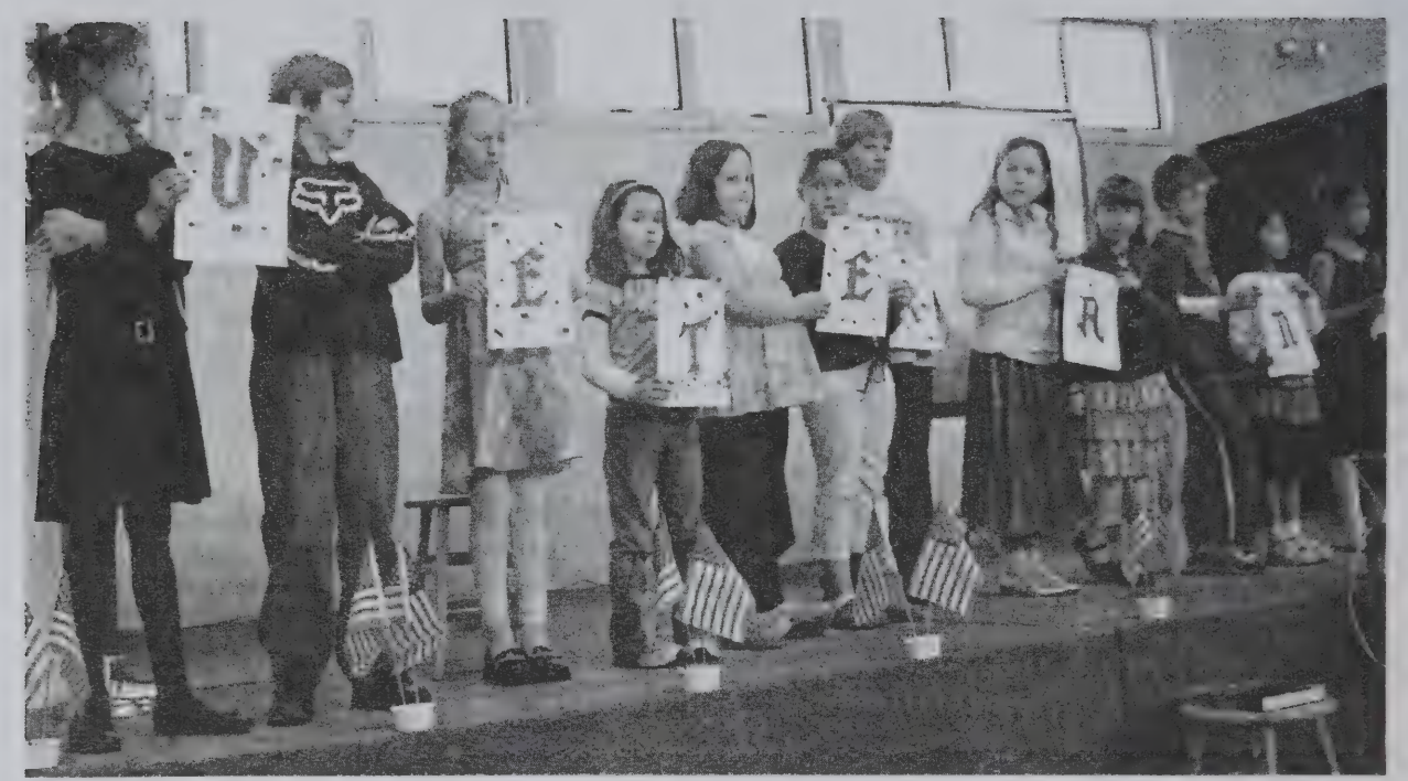
Piermont Village School students at their Veteran's Day skit