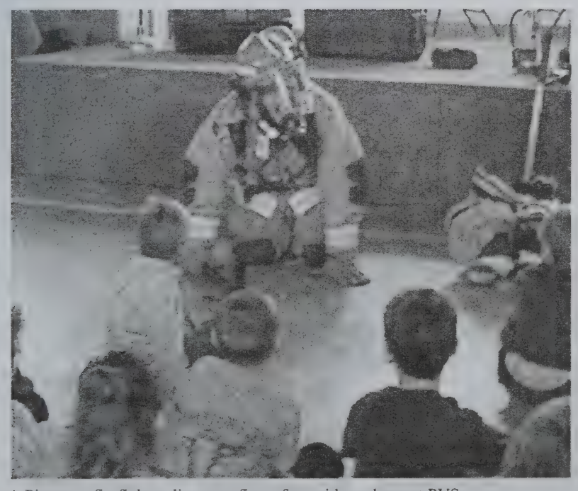
A Piermont firefighter discusses fire safety with students at PVS.

2010 Tags are in but you do need proof of rabies to license them. All must be licensed by April 01, 2010.