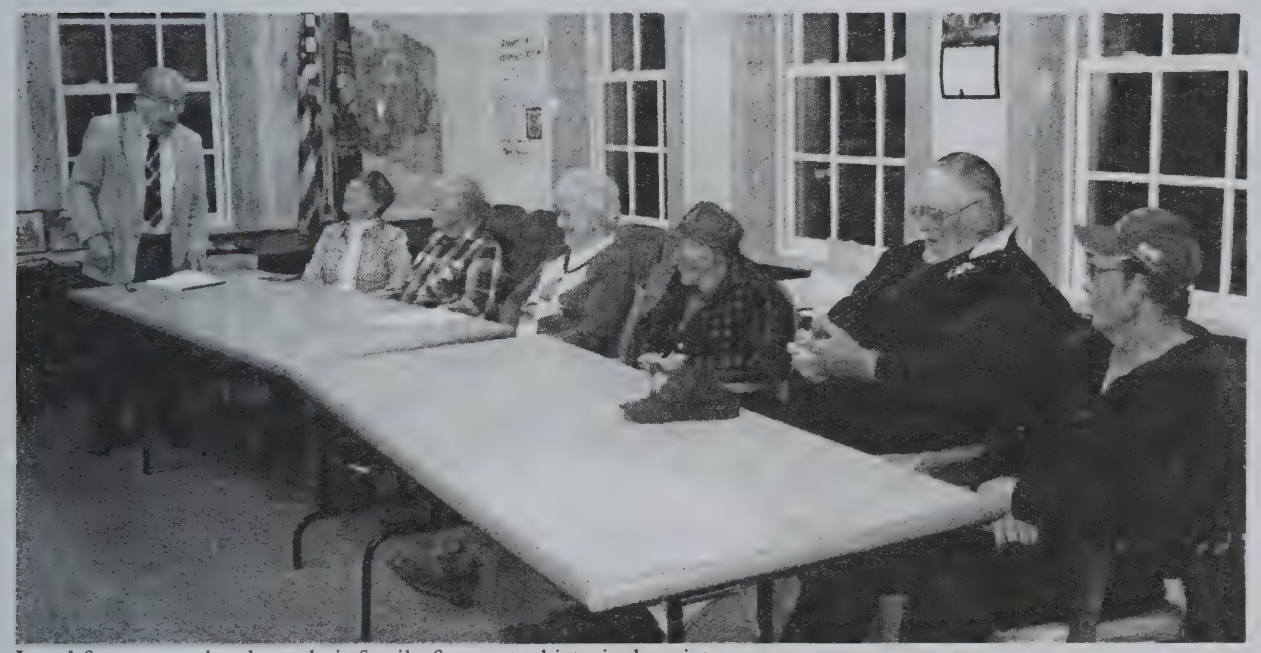
Local farmers spoke about their family farms at a historical society program