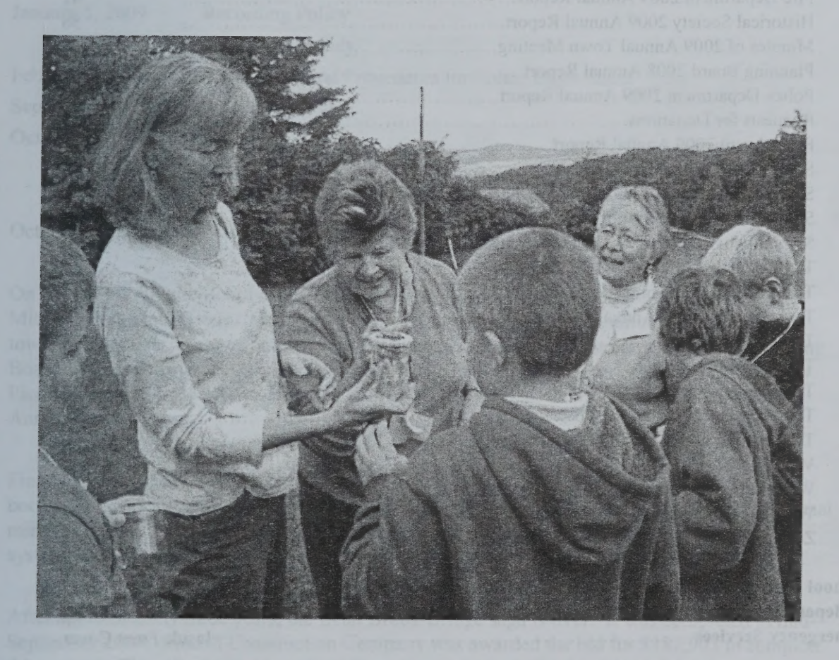
For the Year Ending December 31 2009