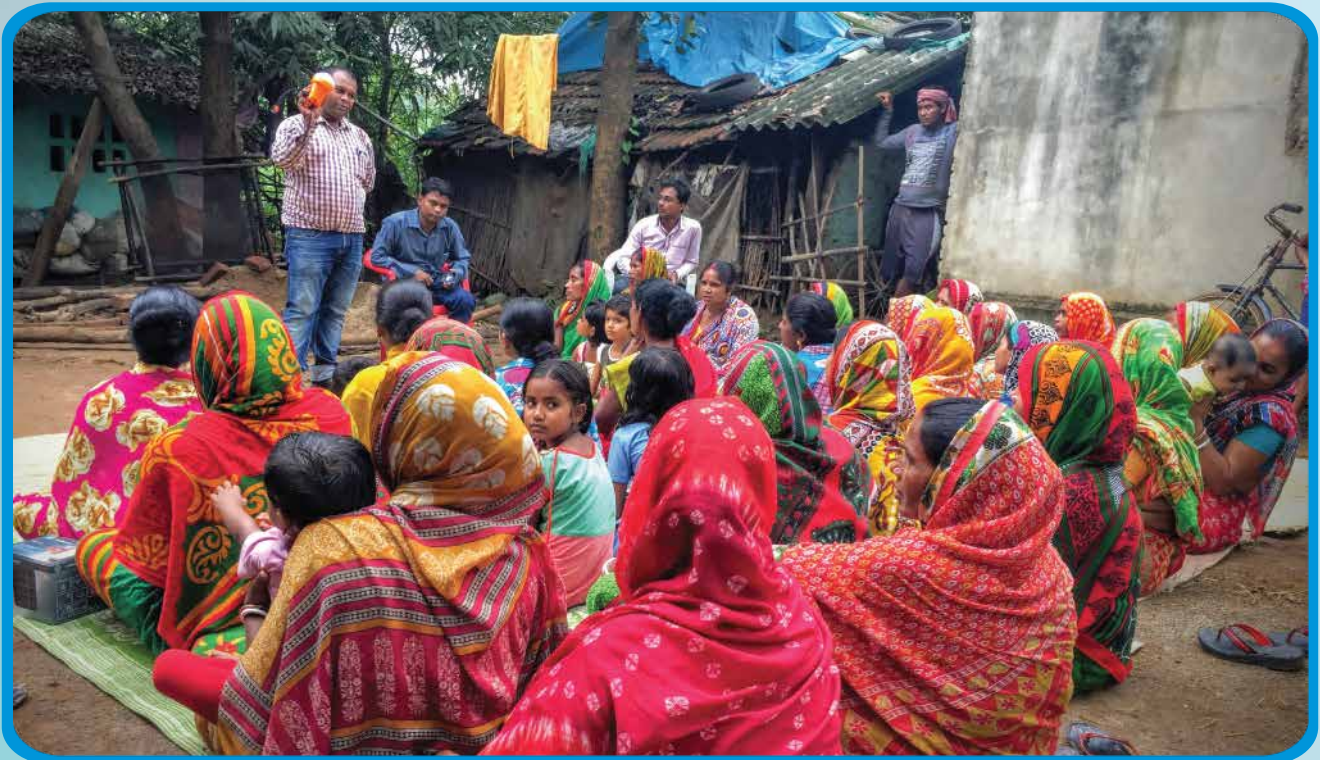
An OEnergy employee demonstrates the ovBeacon to several Self Help Groups.