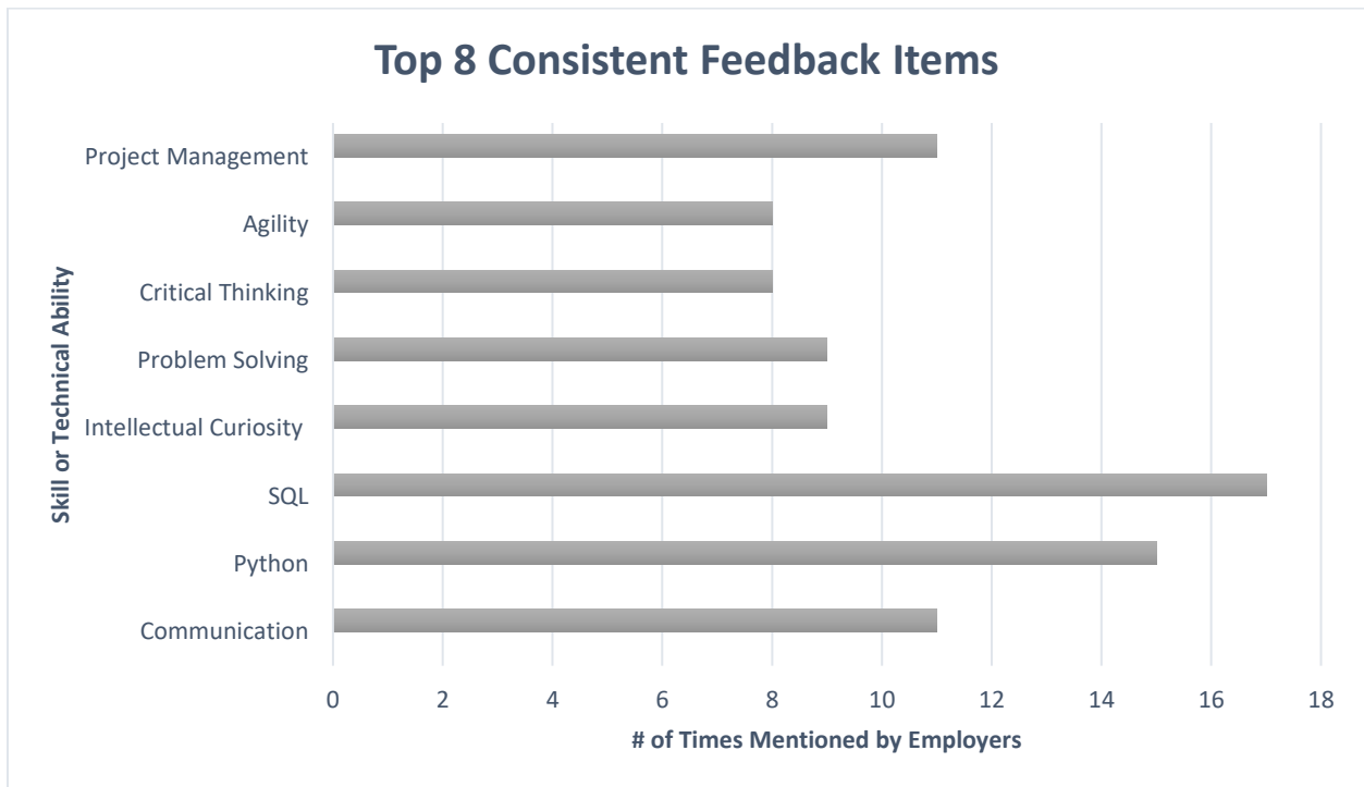
Figure 4- Top Eight Consistent Feedback Items from Qualitative Study