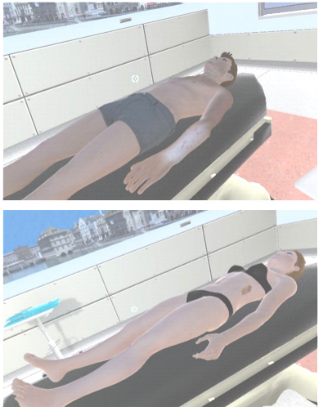
Figure 2. Extracted pictures from the Virtual Derm app [18]. Dermatitis herpetiformis Duhring on the forearm of male adult homunculus ( top ). Melanoma on left flank of female homunculus ( bottom ).