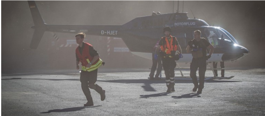
Fig. 2 Example of a catastrophe scenario as used in the described resilience research (Merkt and Wilk-Vollmann, 2021): Role play is used to create realistic, stressful crisis situations; data is collected during and after the scenarios from the participants to reflect their stress level (picture shows one of the authors).

questionnaires for subjective assessment of the stress level are taken based on standardized interview settings.