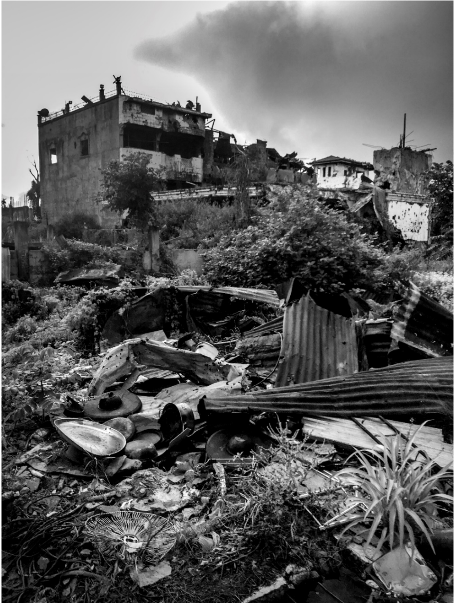
Marawi a year after the war, 2018.