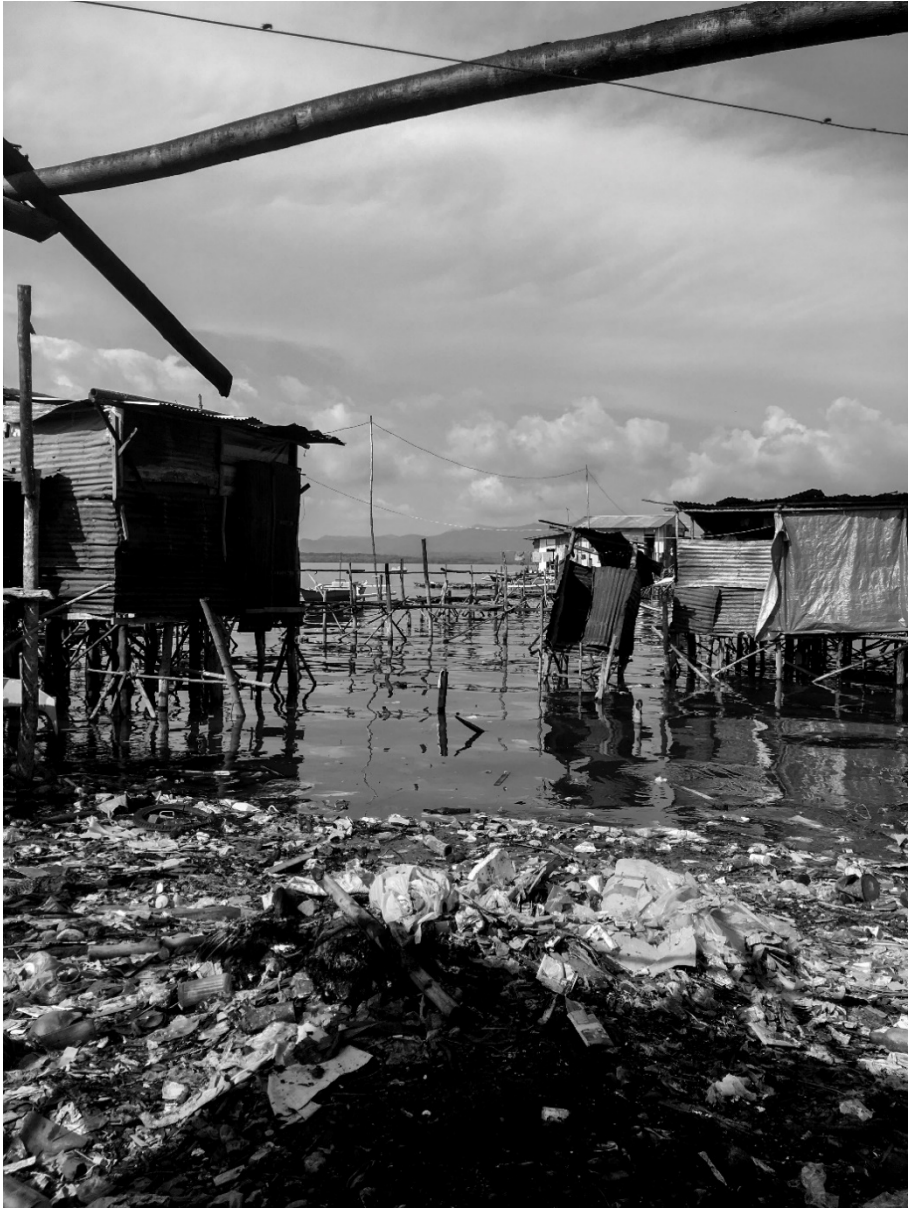
One of the Muslim barangays in Palawan after a fire the previous year, 2018.