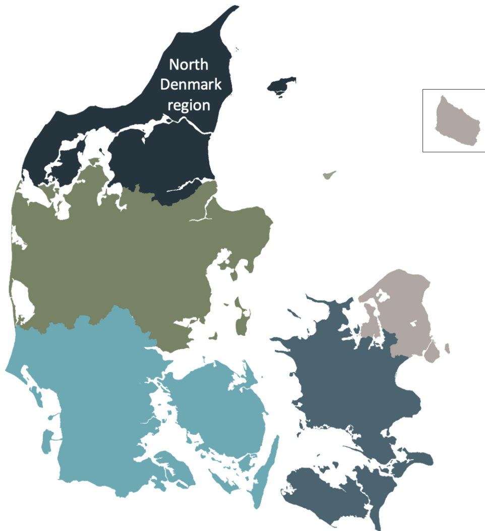
Figure 1 A map of the Denmark. The North Denmark Region is marked with black.

Medical care is tax-supported and free of charge for all residents in Denmark. A unique civil registration number is assigned at birth, which allows for a unique identification of all Danish residents and an unambiguous linkage of individuals between registries. 10 In the North Denmark Region, an outpatient clinic for patients with long-COVID was established on January 1, 2021 at Aalborg University Hospital (Figure 1). The catchment population was 590,439 (January 1, 2021) and 21,727 had tested positive for SARS-CoV-2 in the North Denmark Region during the study period. 14,15 Patients eligible for consultation at the hospital outpatient clinic were required to have had symptoms for >6 weeks and a previous SARS-CoV-2 infection documented by a positive polymerase chain reaction (PCR) test on a respiratory sample or a positive serum antibody test. In addition, all patients admitted with acute COVID-19 infection requiring oxygen treatment were invited to a follow-up examination at Aalborg University Hospital.