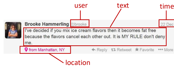
Fig. 1 Geo-tagged Tweet

Time attribute. In some cases, geo-textual objects have a time attribute. The time attribute is often a time point (e.g., 10:05:20 a.m., 30-MAY-2019), capturing the time when the real-world object represented by the geo-textual object was at the indicated location or the time when the object was created. The literature uses terms such as spatio-temporal document or spatio-temporal message for such objects. Common examples include geo-tagged tweets from Twitter (Fig. 1), check-ins at particular Points of Interest, and location reports by individuals who move about. Time attributes may also include time periods (e.g., opening hours: 10:00 a.m. to 9:00 p.m., weekdays).