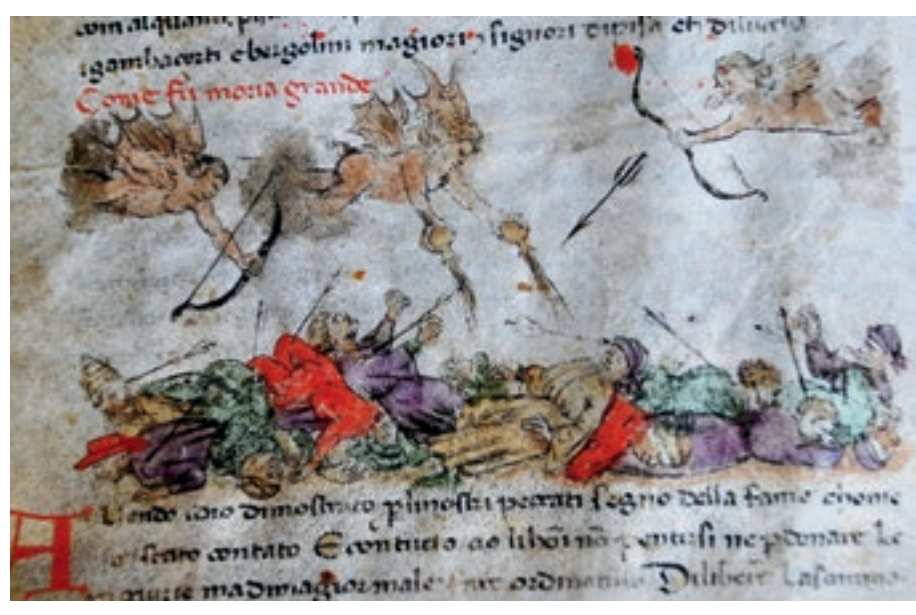
Image 3: Depiction of the plague (morìa grande) of 1348, from Giovanni Sercambi, Croniche Lucchese: Lucca, Archivio di Stato, ms 107, fol. 49v (ca. 1400).

Will there be any hopeful developments to come out of the Covid-19 pandemic? Many are wondering what effect these years will have on