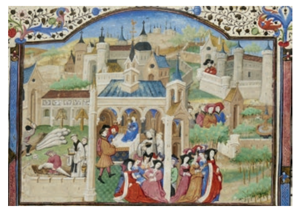
Image 1: From an early French translation of the Decameron: Paris, Bibliothèque nationale de France, fr. 239, fol. 1r (fifteenth century).

In semesters prior to 2020, there was usually a small but vociferous group that insisted they would participate in the carousing (though of course they would not use that word) that marks a hopeless future. A larger faction of