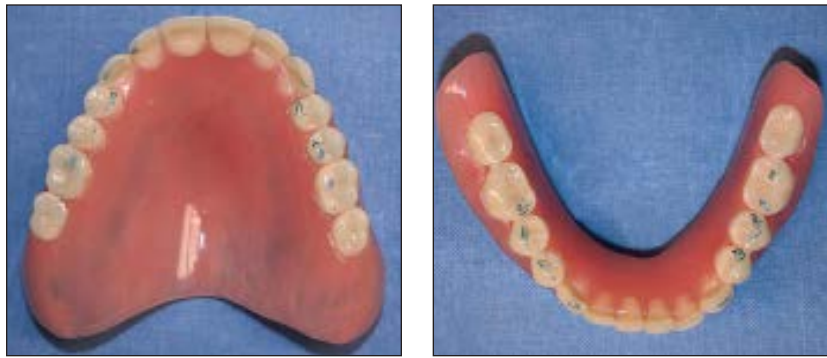
Fig 1 Example set of complete dentures with occlusal markings.