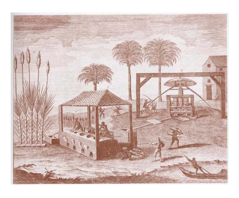
Illustration 5: Engraving of Sugar Manufacture Copper engraving from The Universal Magazine c. 1750