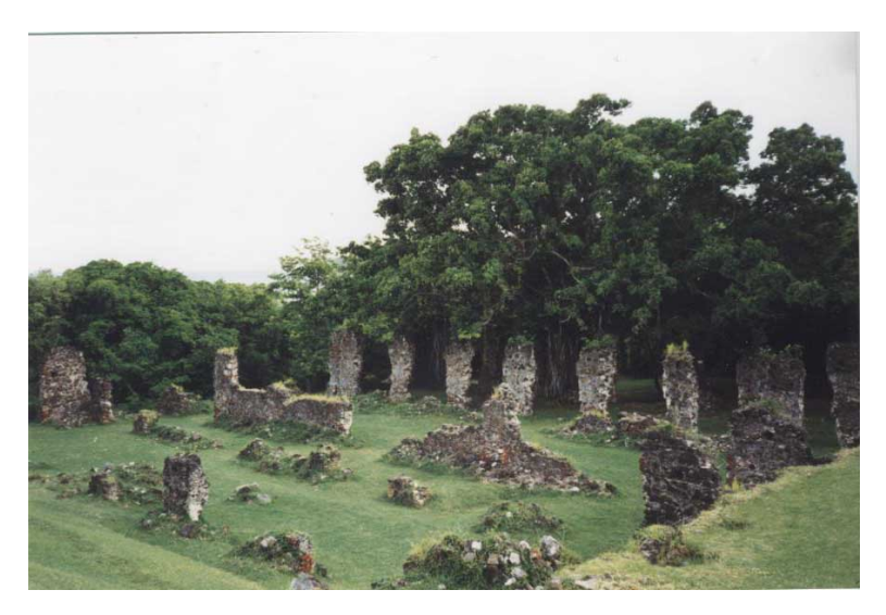
Illustration 6: Author's photo of Chateau Dubuc, Martinique