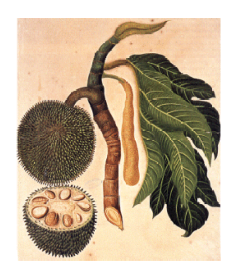
Illustration 3: Engravings of Illustration 4: Engraving of Young Breadfruit Tree and Mature Breadfruit