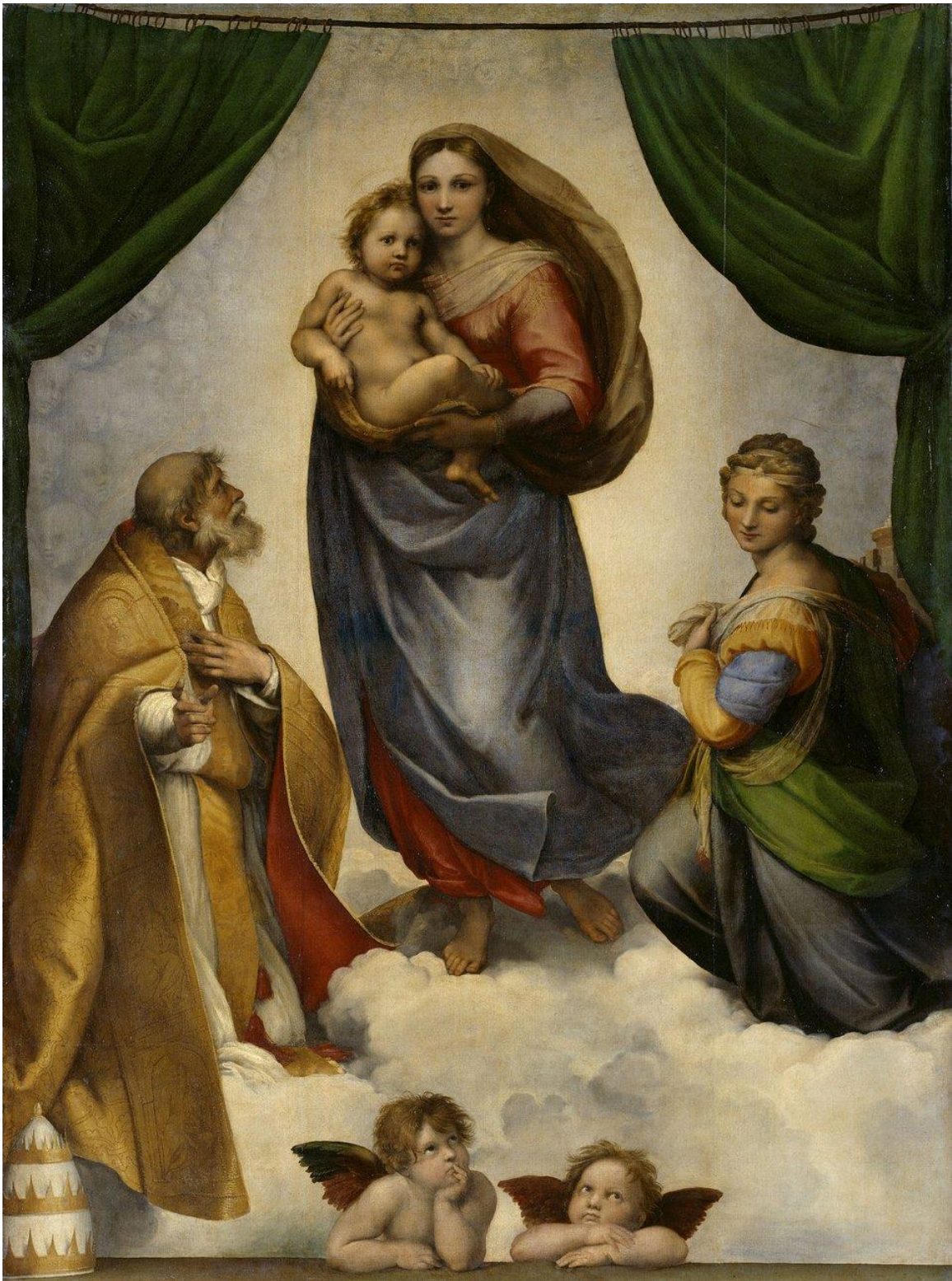
Figure 10. Raphael, Sistine Madonna , 1512-1513, oil on canvas, 104 in. x 77 in. Gemäldegalerie Alte Meister, https://gemaeldegalerie.skd.museum/en/exhibitions/gemaeldegalerie-alte-meister-old-masters-picture-gallery-and-skulpturensammlung-sculpture-collection-up-to-1800/ .