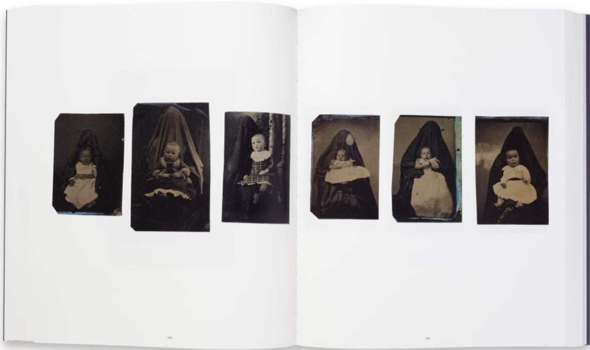
Figure 6. Linda Fregni Nagler, The Hidden Mother , (excerpt from page 164-165), 2013, collection of 1,002 photographs (archival prints such as daguerreotypes, tintypes, cartes de visite, cabinet cards). https://mackbooks.co.uk/products/the-hidden-mother-br-linda-fregni-nagler .