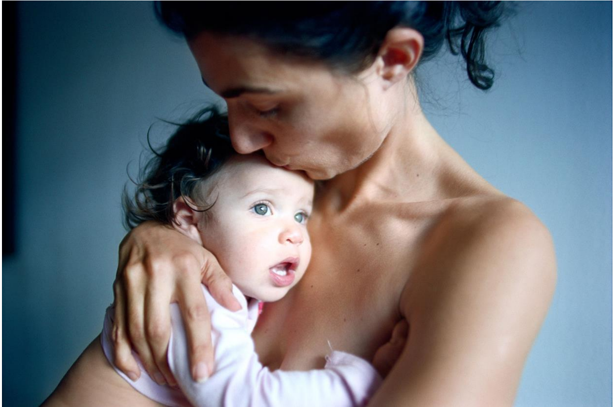
Figure 3. Elinor Carucci, Trying to protect Emmanuelle , 2006, archival pigment print. Unknown Collection, http://www.elinorcarucci.com/mother.php#0 .