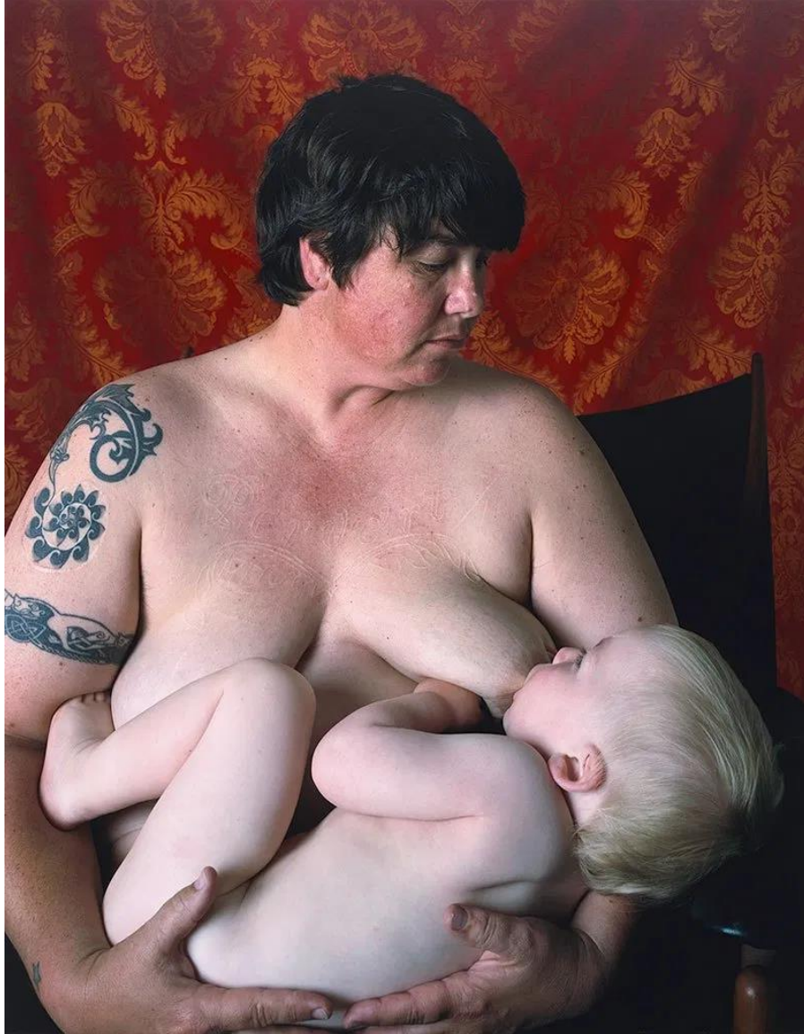
Figure 8. Catherine Opie, Self Portrait/Nursing , 2004, chromogenic print, 40 in. x 31 in. Guggenheim Museum, https://www.guggenheim.org/artwork/14666 .