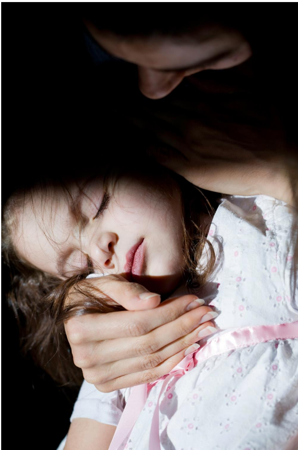
Figure 4. Elinor Carucci, I Will Protect You , 2008, archival pigment print, 22 in. x 17 in. Edwynn Houk Gallery, https://www.houkgallery.com/exhibitions/45/works/artworks-65474-elinor-carucci-i-will-protect-you-2008/ .