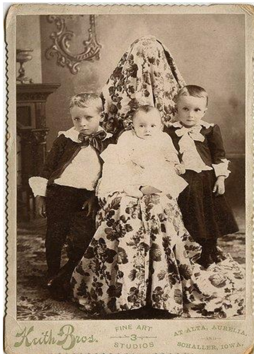
Figure 5. Keith Bros Fine Art Studios, late 1800's. Iowa, USA.