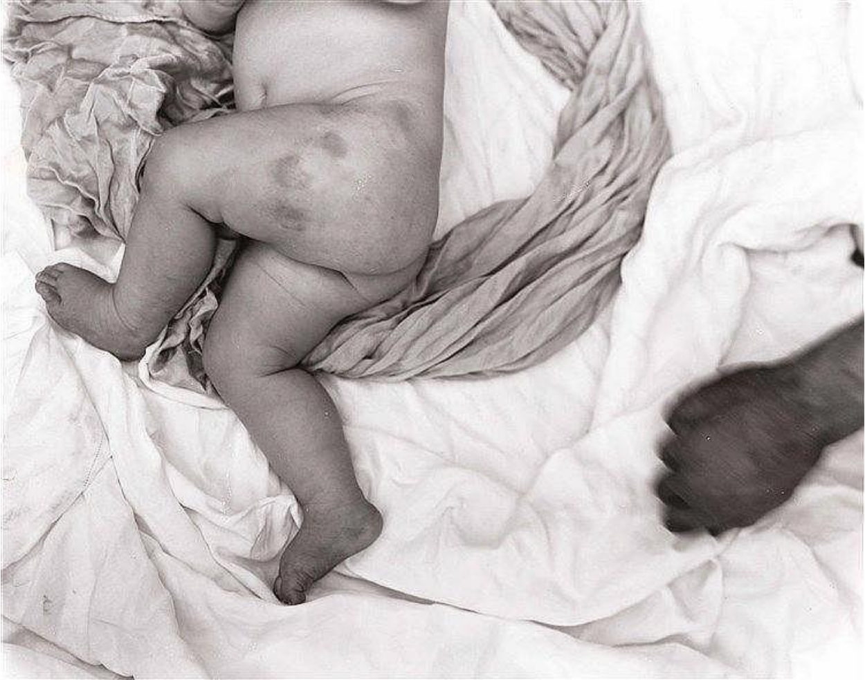
Figure 2. Sally Mann, Lee's Dirty Hands , 1986, RC/gelatin silver print, 7.99 in. x 9.96 in. Unknown Collection, https://www.invaluable.com/auction-lot/sally-mann-1951-lees-dirty-hand-tirage-argentique-81-c-cc14ea7bef .