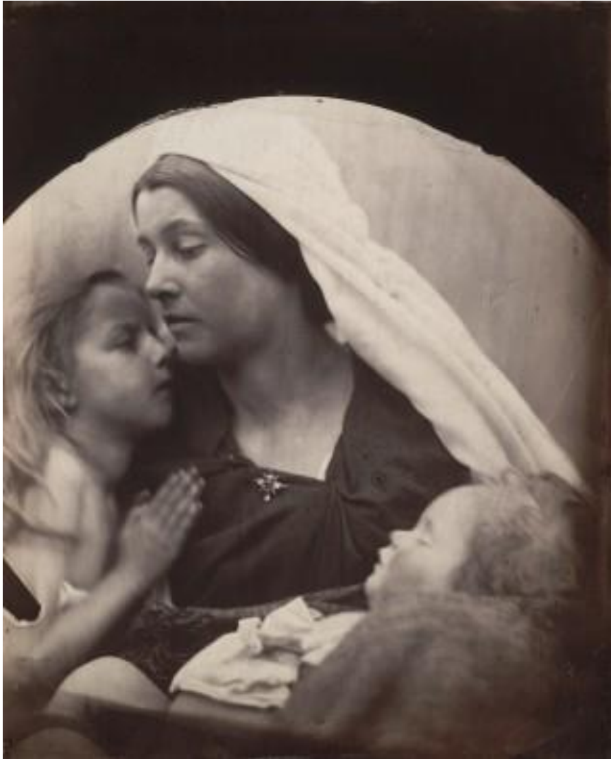
Figure 9. Julia Margaret Cameron, Madonna with Children , 1864, albu­men silver print, 10.5 in. x 8 5/8 in.