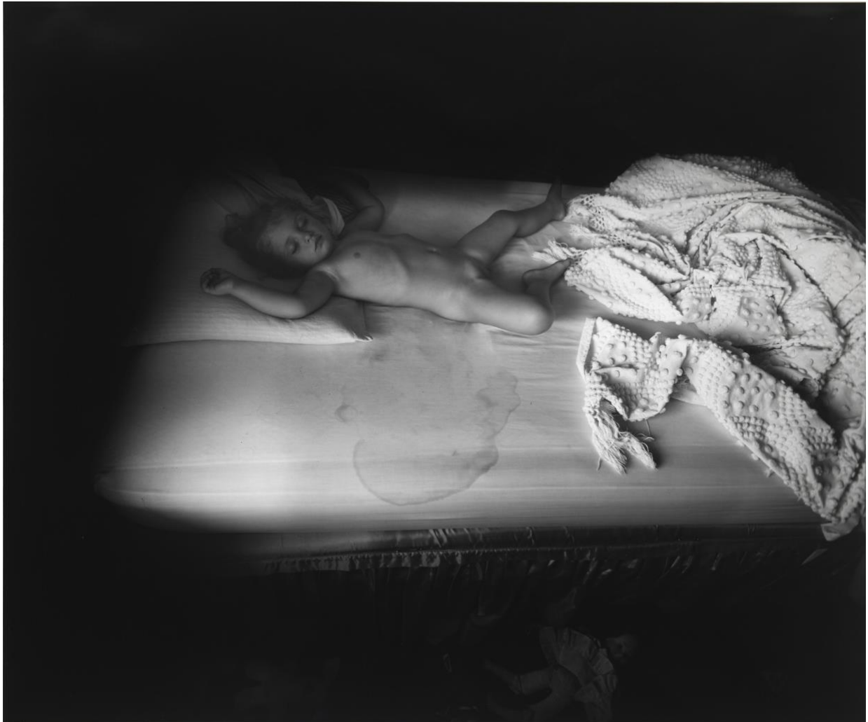
Figure 1. Sally Mann, The Wet Bed , 1987, platinum print, 19 ¾ in. x 23 ¼ in. Smithsonian American Art Museum, https://americanart.si.edu/artwork/wet-bed-15559 .