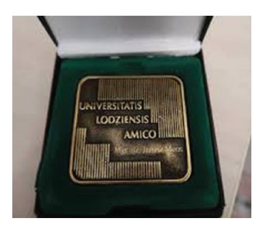
Illustration 11. University of Lodz medal Medal Universitatis Lodziensis Amico

In 2013 the University of Lodz awarded the Australian Embassy in Poland the Medal Universitatis Lodziensis Amico upon the request from the British and Commonwealth Department.