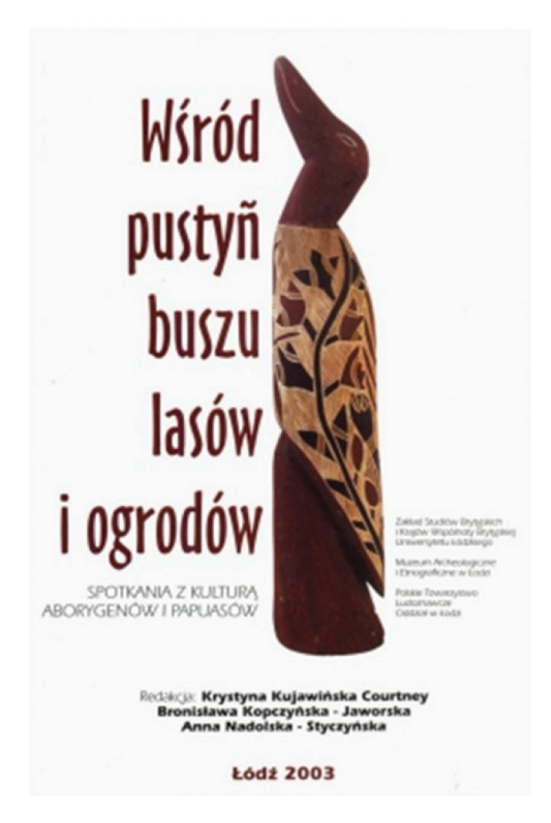
Illustration 6. Book cover

The Department organised the In Deserts, Forests, and Orchards: Meetings with Papua and Aboriginal Culture conference together with the Łodź Archeological Museum. A rich collection of material culture exhibits and film presentations of various documentaries accompanied the conference. The outcome took the form of a collection of essays Wśród pustyń, buszu, lasów i ogrodów: spotkania z kulturą Papuasów i Aborygenów , eds. Krystyna Kujawińska Courtney, Bronisława Kopczyńska-Jaworska, and Anna Nadolska-Styczyńska, Łódź: Wydawnictwo Biblioteka, 2003, pp. 137.