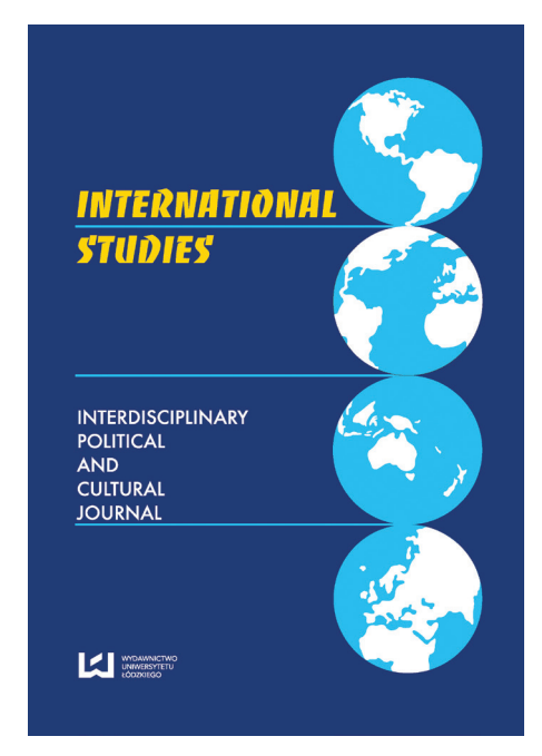
Illustration 2. IS volume cover

The International Studies. Interdisciplinary Political and Cultural Journal published a special thematic volume presenting the outcomes of the project: Australian Multiculturalism to Poland and Beyond in the Perspective of European Integration, ed. Krystyna Kujawińska Courtney, 2003, vol. 5, no 1.