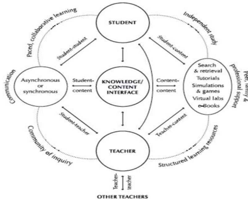
FIGURE 1. Anderson and Gerison online learning interaction pattern

The pattern of interaction above describes three components that interact with each other, namely educators, students, and learning resources (content). The pattern of interaction between educators and students, and students and students is carried out synchronously. The interaction between educators and students uses a community inquiry approach. Meanwhile, the interaction between students and students uses a collaborative approach. This interaction pattern is an online learning pattern.