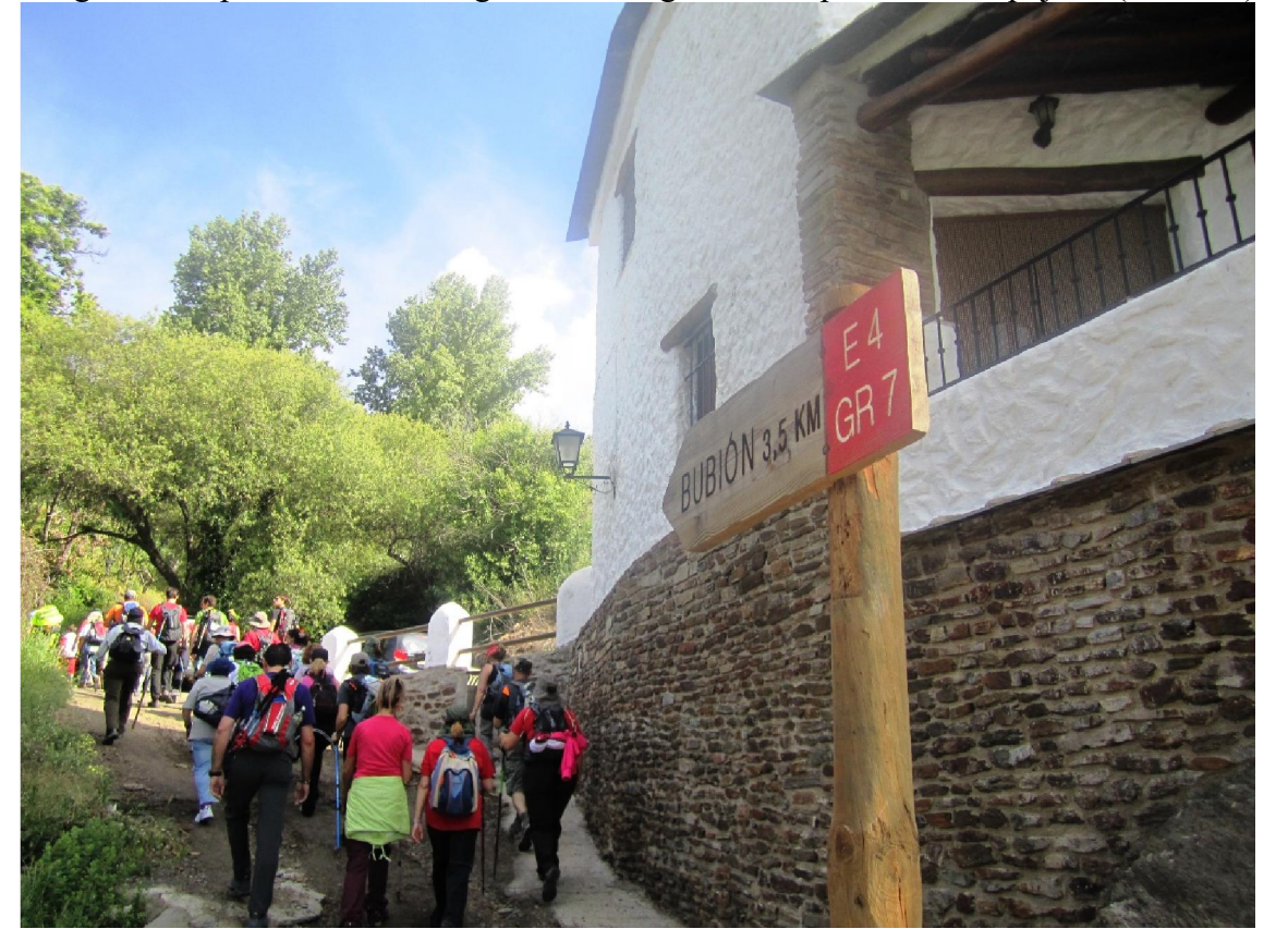
Image 1. Group of hikers crossing a town along a marked path in the Alpujarra (Granada)

• The multiplying effect of economic activities derived from the recovery, maintenance, supervision, reappraisal and the promotion of new uses of public paths could, in turn, lead to a certain fixation of the population in the region. Previous studies have shown that after becoming the spearhead of new economic activities linked to the promotion of sports and tourism, some municipalities later become population centres (Moscoso-Sánchez, 2003; Moscoso-Sánchez, 2010). There is evidence that the local economies in various populations in Andalusia are now maintained by the activities surrounding public rights of way. This is the case of villages in Sierra Nevada and the Alpujarras (Granada), the Sierras of Cazorla, Segura and Las Villas (Jaén), the Sierra of Grazalema (Cádiz), the region of La Axarquía (Málaga), the Sierra of las Subbéticas Cordobesas (Córdoba), the Sierra Norte of Sevilla (Seville) and the Sierra of Aracena (Huelva).