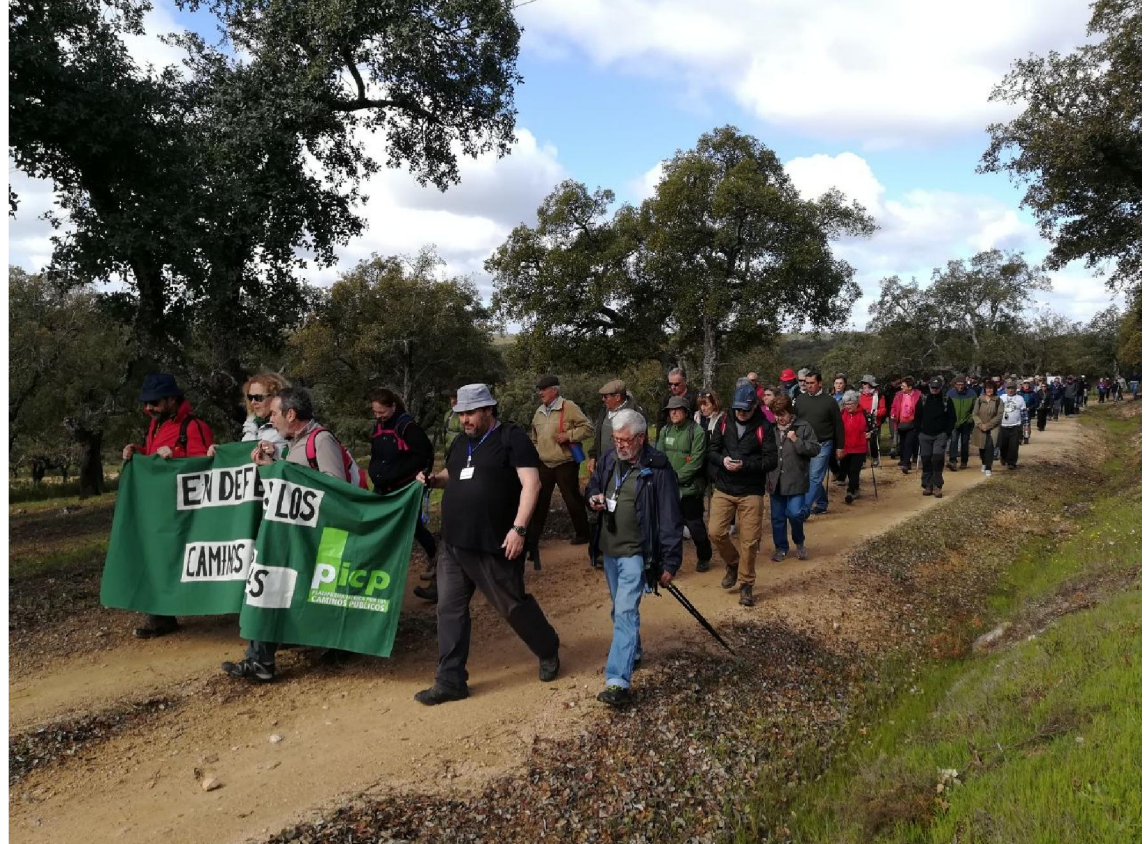
Image 2. Group of hikers during a protest march in defense of public paths

• And lastly, small and medium-sized farmers and livestock breeders and, in particular, environmental associations, citizens' platforms for the defence of public roads, sports associations and federations active in hiking, mountain biking and horse riding, cultural and pilgrimage associations, as well as other scattered groups in defence of public assets, are organising themselves —generally through citizens' platforms— to demand change through applying political pressure. Their actions include rallies in front of town halls or other symbolic places (they have even performed actions in the European Parliament) and via weekly mass rallies on public rural paths that have been blocked or usurped by private individuals.