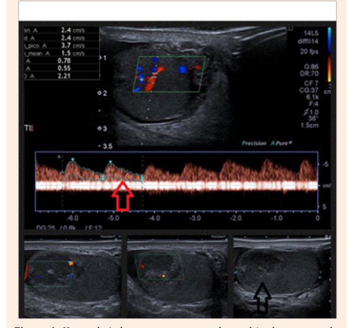
Figure 1: Hypoechoic heterogeneous mass located in the upper pole of the left testis of 17 x 17 x 17 mm, (L x W x H) with a volume of 2,9 cc. Black Arrow pointed to hypoechoic área on the upper pole. Color doppler US showed preserved flow within the mass, the remaining testis exhibited normal echogenicity and vascularity. Red Arrow shows preserved peak systolic velocity within the hypoechoic área of the upper pole of the left testis.

Received: November 19, 2017 | Published: December 07, 2017