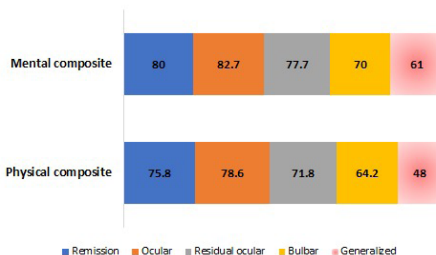
Figure 2. Score of the physical and mental component of the SF-36 scale by type of myasthenia gravis, in Bolding et al. (10). Mean values. MG: Myasthenia gravis.

The study by Hoffmann et al. in 2016 sought to assess the impact of fatigue, measured with the Chalder Fatigue Scale (CFQ). In general, it was shown that the quality of life scores were significantly higher in patients who displayed fatigue ( CFQ \geq 4 ) in the three types of MG, patients with GMG having a worse perception of quality of life (mean of 22.7) compared with patients with MG in remission (mean of 8.6) and