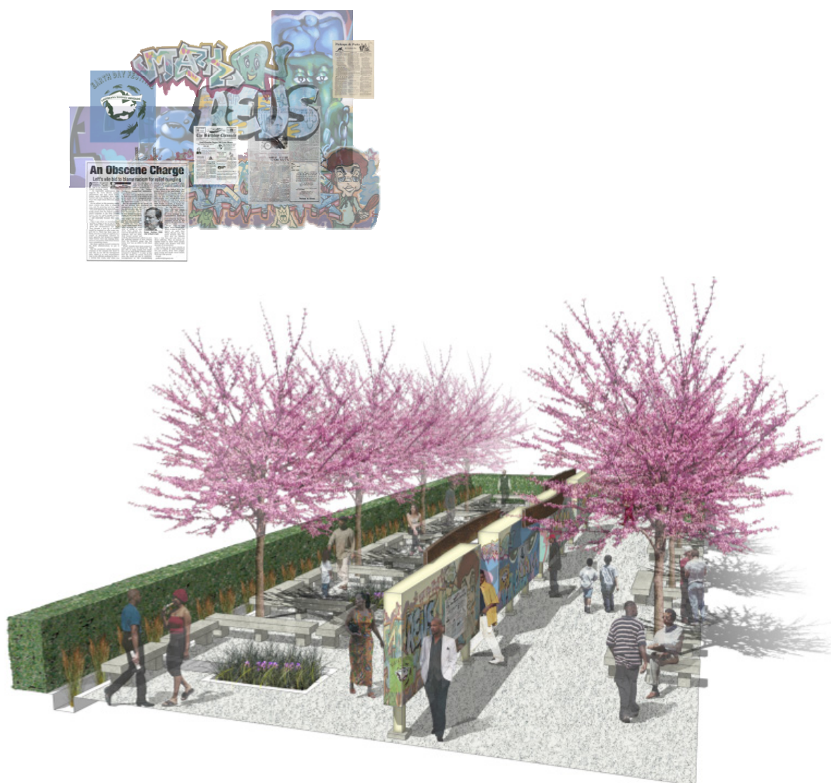
Figure 10. Ryan, Jonathon. Message Board , 2009.

Jonathon Ryan's proposal, Message Board , was inspired by the accretive, layered visual effects of both the Heidelberg project and graffiti art (Figure 10). Ryan proposes a small park centered around the idea of a community 'message board:' a durable wall intended as a medium for news and self-expression. Ryan's idea recognizes that the community needs a place for many activities, including protest. The wall is composed of a minimal steel frame covered by barge boards, large timbers reclaimed from New Orleans maritime industry. Over time, the wall will become a thick palimpsest of paint, paper signs, stickers, and other materials nailed to the board.