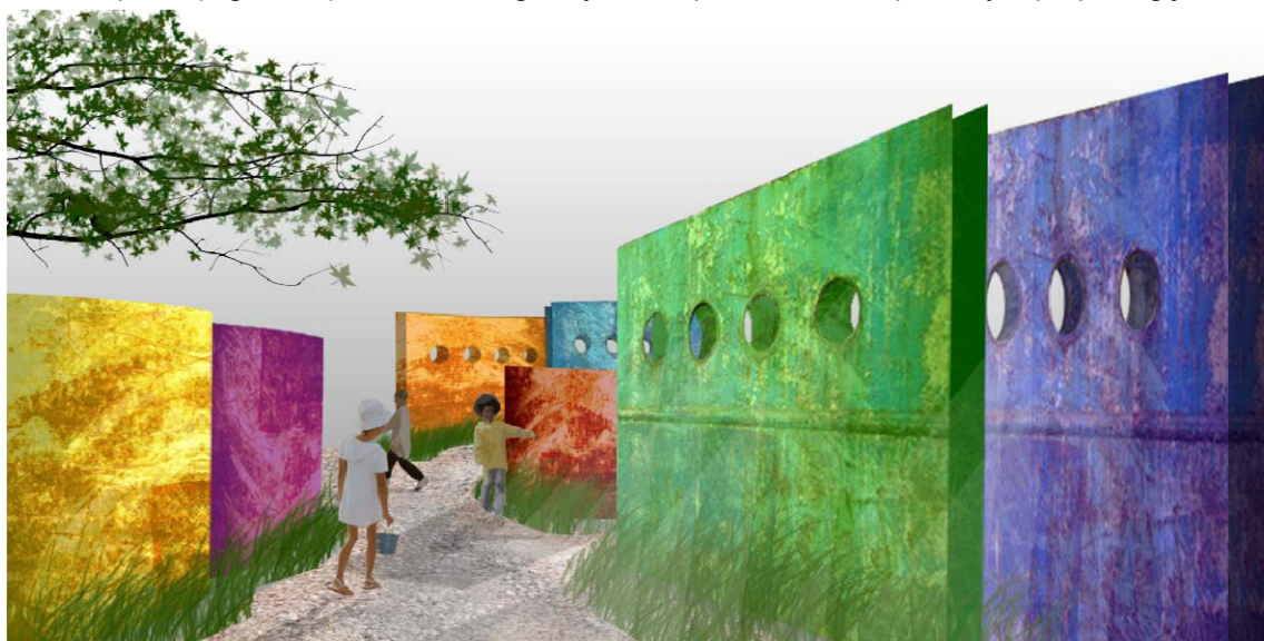
Figure 11. Schuette, Krystal M. Hide and Seek , 2009.

Of all the student proposals, Hide and Seek , by Krystal M. Schuette, most strongly merges site and sculpture (Figure 11). Schuette originally developed an idea inspired by repurposing junk, a part of