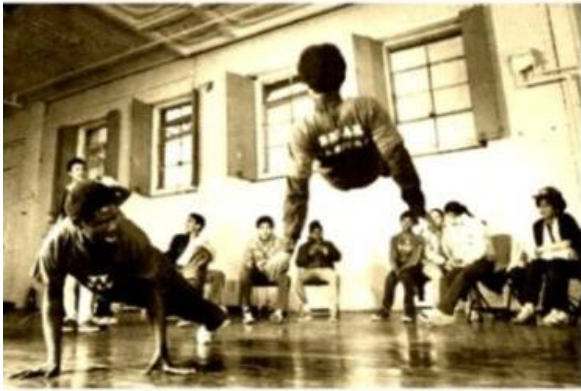
Figure 3. The Rock Steady Crew , pictured in 1982, led by 'Crazy Legs,' created some of the most influential breakdance styles to come out of the Bronx, available on-line at http://hiphop.sh/legs

Dancers, rappers, and graffitists enjoyed at least short term recognition in the SoHo art district and Manhattan club scene, where they were invited to play and dance at clubs or exhibit in galleries (Rose, 1994, pp.46, 51). A famous example, Jean Michel Basquiat became a gallery artist after his start in the New York street graffiti world (Figure 4).