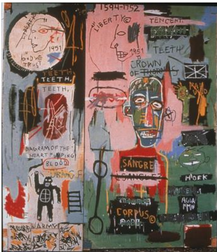
Figure 4. Basquiat, Jean Michel. In Italian , 1983, acrylic on canvas, 88x77 inches, © 2007 Artists Rights Society (ARS), New York / ADAGP, Paris.

Dancers, rappers, and graffitists enjoyed at least short term recognition in the SoHo art district and Manhattan club scene, where they were invited to play and dance at clubs or exhibit in galleries (Rose, 1994, pp.46, 51). A famous example, Jean Michel Basquiat became a gallery artist after his start in the New York street graffiti world (Figure 4).