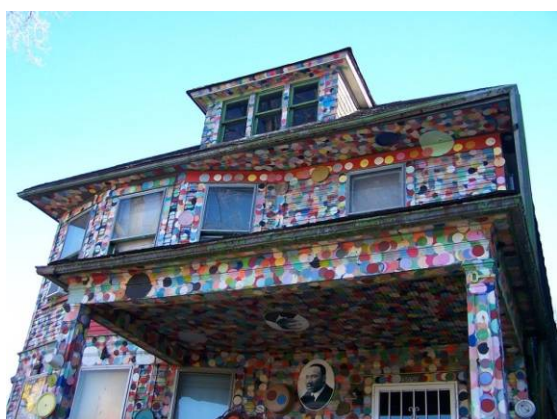
Figure 8. Tyree Guyton. Heidelberg Project, detail of Dotty Wotty House. 1990's–present.