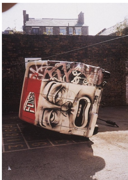
Figure 6. McGee, Barry. Installation at Liverpool Biennial, 2002.