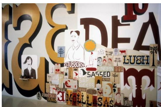
Figure 5. Kilgallen, Margaret. Installation at the Drawing Center, New York, 1997.

"I like things that are handmade and I like to see people's hand in the world, anywhere in the world; it doesn't matter to me where it is. And in my own work, I do everything by hand. I don't project or use anything mechanical, because even though I do spend a lot of time trying to perfect my line work and my hand, my hand will always be imperfect because it's human....From a distance [a line] might look straight, but when you get close up, you can always see the line waver. And I think that's where the beauty is" (PBS, 2001).