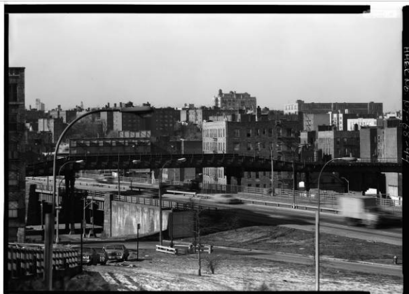
Figure 2. Cross Bronx Expressway: looking northwest at Third Avenue elevated over the expressway, 1973.

Tricia Rose, in Black Noise , her account of hip hop culture in 20 th century America, traces the origins of hip hop to the Bronx, New York in the late 1970's. Rose links the destabilization of settled neighborhoods during and after the construction of the Cross Bronx expressway (Figure 2) to the invention of new, original elements of society: breakdance (Figure 3), rap music, and graffiti street art of the Bronx scene. Rose also connects joblessness and obsolete job skills of the Bronx' newly destabilized population to the invention of hip hop culture. Rose presents early hip hop culture as a dialectical activity, one in which the urban decay and economic hardship of late 1970's New York combines with a creative youth culture in the Bronx to synthesize a cultural movement that continues to influence, music, dance, and visual arts today (1994, pp.27-35).