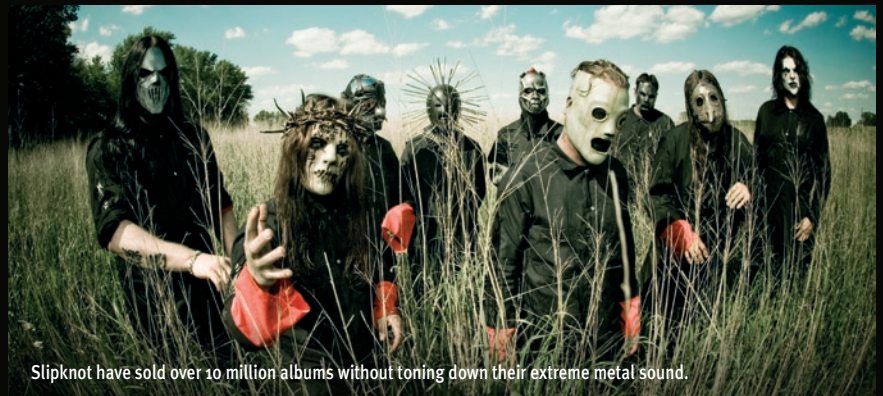
Slipknot have sold over 10 million albums without toning down their extreme metal sound.

apparent to the band on playback. It is not a given that just because the songs work well in a gig scenario, the same will apply in the studio. (It is obviously preferable to be in the same room as the band for pre-production, but when this is not possible, a certain amount of work