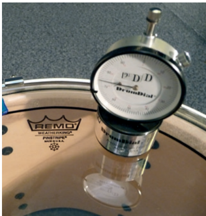
Drum tuning is a skill that can defeat novices, and devices such as the Drum Dial can provide valuable help.

► we endeavour to capture, because they are the one over which we have most control. Drum tuning is an art in itself and its importance cannot be overlooked, as even the best-quality drum kit on the market is still going to sound poor unless properly tuned. Usually I'll take the opportunity to get a kit tuned before getting into the studio, as this can be a lengthy process.