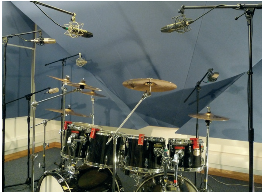
► This photo shows a fairly typical setup for recording a metal drummer. In other styles of music one might use a pair of overheads as the main foundation of the drum sound, but here, the mics above the kit are serving primarily as spot mics for individual cymbals. Note also the D-Drum triggers, used to provide spill-free signals for triggering samples at the mix.

Moving onto the overheads, my mic technique here will always be dictated by the number of cymbals being used, which, within the extreme metal genre, can be quite high. Much of the energy and driving edge of the production style is provided by the cymbals, and it is imperative that the dynamics between them are as evenly balanced as possible.