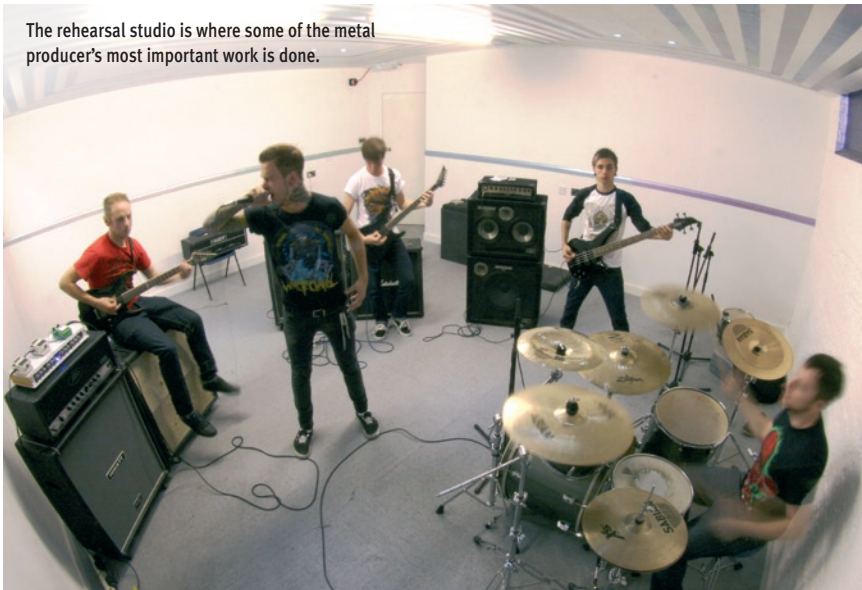
The rehearsal studio is where some of the metal producer's most important work is done.

▶ to save money. It pre-empts any problems that may appear when the studio clock is ticking, saving time, and therefore money, in the process.