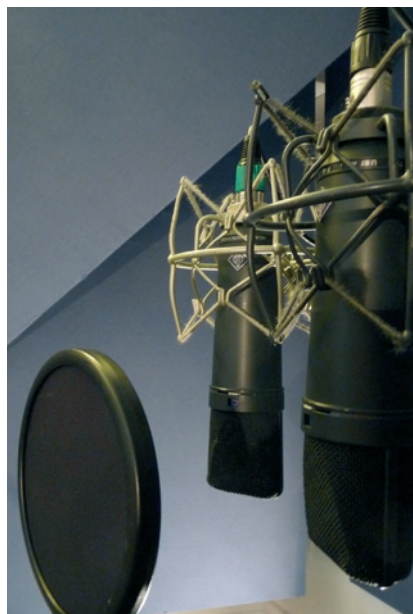
Metal vocalists often operate over a huge dynamic range, and it can be beneficial to record two microphones: a close mic for the intimate, quiet moments and a distant mic for full-on screaming.

It is usual for productions in the metal genre to have a minimum of two rhythm guitar tracks per side (ie. two rhythm guitars hard left and two tracks hard right). Occasionally, however, bands record just one guitar each side where their riffs