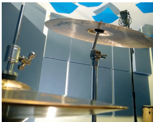
When miking cymbals, it's a good idea to minimise hi-hat bleed by positioning the mic so that the cymbal shields it from the hi-hat.

If there's a possibility you may be using samples, and you are able to do so, it's well worth recording the audio ►