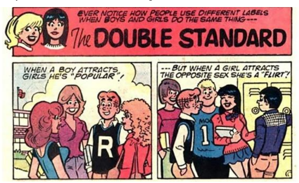
Activity 5 – Session 3: Double Standards picture

Link to Padlet: <a href="https://padlet.com/patricia_nietog/ycskond7y2aruume">https://padlet.com/patricia_nietog/ycskond7y2aruume</a>