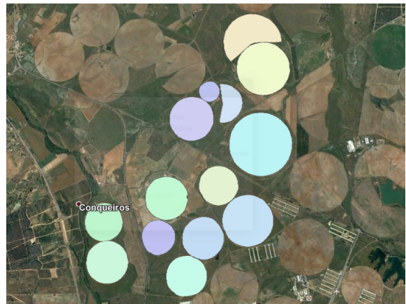
Figure 1: Google view images of 14 parcels

parcels are from Alentejo region with coordinates between (37°56'29.13" N , 8°22'21.95" W) and (37°55'32.44" N, 8°21'02.23" W). Figure 1 shows the Google View image of these 14 parcels. EC value was measured at 10-meter intervals resulting in a total of 65003 points.