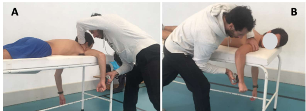
Figure 1. Shoulder external and internal rotation measurements. (A)—Shoulder external rotation measurement; (B)—Shoulder internal rotation measurement.

A “standard” swimming training session was performed between measurements. The training session was carried out according to the recommendations of the Portuguese Swimming Federation regarding the activities of the youth national squads participating in international competitions [17]. The total volume of the training session was 4600 m, including: (i) 900 m of warming-up tasks with low-intensity bouts; (ii) 800 m of technical training with technical drills; (iii) 400 m of velocity tasks with sprint bouts; (iv) 1000 m of aerobic capacity bouts; (v) 600 m of aerobic power bouts; and (vi) 900 m of recovery sets with low-intensity tasks. The session was previously sent to all coaches for approval and to be part of the training unit within each testing day.