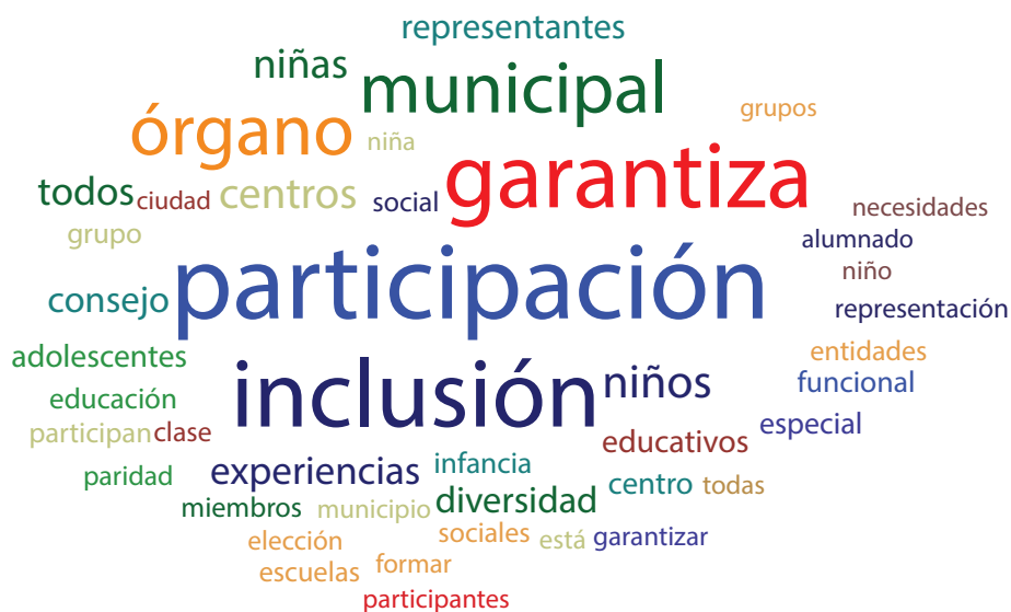
Figure 2. Word cloud.

99:2 Participants from different origins, including North Africans, Africans, Latin Americans, among others. Participants belonging to LGBTIQ+ groups. Participants with functional diversity.