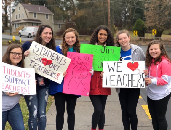
Figure 13: Students Strike in Support of their Teachers on March 2, 2018 70