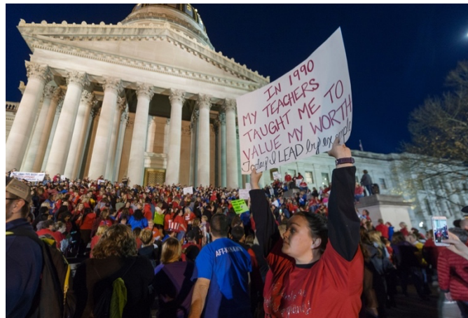
Figure 10: A Teacher Holds a Sign at the Capitol Late in the Evening in 2018 38

teachers out of the passivity expected of them under neoliberalism and incite them to perform resistance alongside their colleagues.