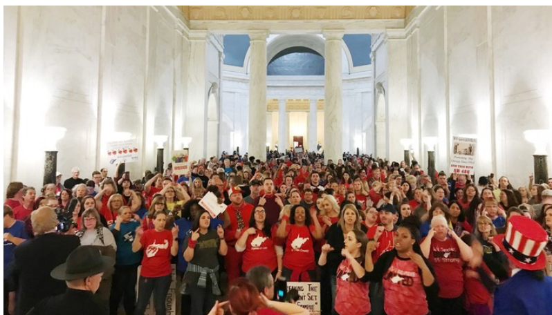
Figure 2: Teachers Singing Inside the State Capitol Building in 2018 9

floor, rising to the second floor, and echoing off the closed doors of the state senators' offices. In one voice, they shouted chants such as "A freeze is not a fix," "Put it in writing," and "We are worthy." They sang the unofficial state song, John Denver's "Country Roads," along with other tunes such as Twisted Sister's "We're Not Gonna Take It" and the White Stripes' "Seven Nation Army." Together they danced, they clapped, they whooped and cheered each other on, in the way a sports team supports each of its members. In individual schoolyards across the state, teachers and public employees also cheered, chanted, and sang together—their voices in unison albeit in smaller numbers. In the image below, teachers are either mid-chant or song while occupying the first floor of the state capitol building. In either case, their voices echo off the white marble columns and walls surrounding them in stark contrast to the red of their shirts. They raise their hands in the same gesture, pointing to their eyes. A striker at the front faces her fellow educators, leading them in the gesture. The chanting or singing was accompanied by gesture and movement, making the performance of unity one of both voice and body. Teachers performed in unison inside the capitol building from morning until evening, moving together with the rhythm of solidarity.