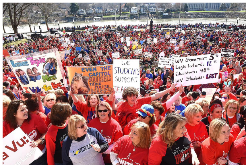
Figure 7: Thousands of Strikers Protest Outside the State Capitol Building in 2018 25