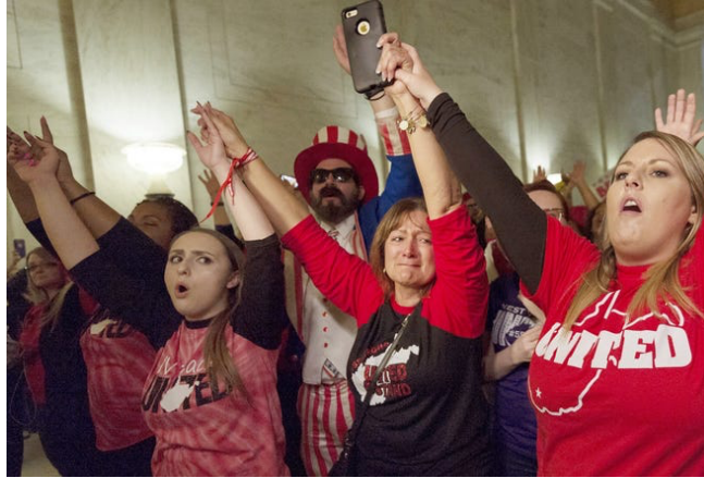
Figure 3: A Teacher Cries, 2018 11

The performance of a demos was further heightened by the teachers' decision to wear the same color leading up to, during, and after the strikes. Red was everywhere. Red, the color symbolic of both Marxism and 'Trump country.' Red, the color adopted in the early twentieth century by West Virginia coal miners on strike, who tied red bandanas around their necks (yes, this is where the term 'redneck' comes from). Red, the color that became symbolic of all teacher strikes across the country, which led to the slogan #RedforEd. Red not only filled the state capitol during the strike, but it filled individual school hallways across the state in the weeks leading up to the walk-out. On Wednesdays of these weeks, teachers and public employees wore red t-shirts to express their allegiance to each other and to the burgeoning movement. 12