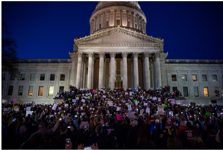
Figure 9: Thousands of Teachers Outside the Capitol Late into the Evening in 2018 35