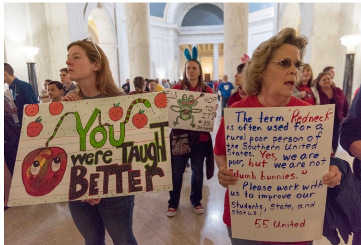
Figure 22: Teachers Address ‘Dumb Bunnies’ in Signs and Costumes 82

Teachers further inhabited authority by evoking connections to women’s empowerment movements through images and phrasing on posters. For example, several signs depicted Rosie the Riveter, an image of women’s professional power. One such sign said, “I Fight For Your Kids Everyday. Will You Do The Same For Us?” 83 A different sign alluded to another image of