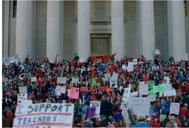
Figure 8: Thousands of Teachers Hold Signs Outside the State Capitol Building in 2018 34

between the aesthetics of the law and the aesthetics of the protesting teachers makes all the more apparent their refusal to remain eminently governable and their performance instead of courageous resistance. In the second image, we see the same stark contrast, and the same courageous resistance. Yet the deep blue of the sky and the hundreds of cellphones lit up across the crowd make the image of resistance appear not only courageous, but also beautiful .