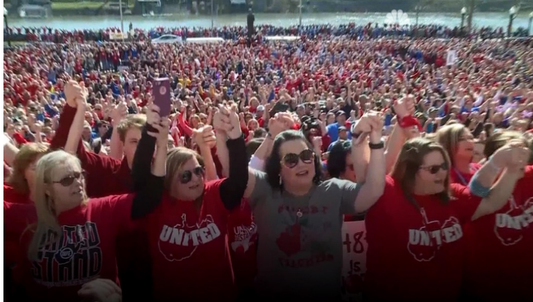
Figure 1: Teachers Hold Hands Outside the Capitol Building in February 2018 8

Together, West Virginia teachers marched on the capitol, filling the building's cavernous, marble first floor and spilling out onto the white staircase leading down to the Kanawha River. Each day during the 2018 strike, approximately 5,000 teachers protested at the capitol building, nearly one-fourth of the state's teaching force . They stood side-by-side, in the building itself and outside on the sprawling steps below, feeling the sublime vastness of their numbers and the intimate closeness of thousands and thousands of other teachers and public employees. During every school day throughout the strike, rain or shine, even in the bitter February cold, protestors filled the capitol and the surrounding outside area. Meanwhile, those teachers and public employees who were not at the capitol managed to link arms and protest together outside their individual schools. Together, they stood on school lawns, holding homemade protest signs and waving to cars passing by. All this served to create a tremendous feeling of solidarity among teachers and those associated with the teaching profession—a far cry from the isolation of the classroom and school.