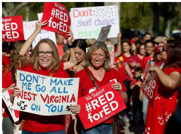
Figure 23: An Arizona Teacher on Strike References the West Virginia Teachers Strikes 22

This teacher expresses feeling empowered precisely because she witnessed the teachers of West Virginia walk out. Without witnessing the West Virginia teachers on strike, teachers from other states might not have felt empowered to organize their own efforts, and any of the subsequent ten education strikes to follow might not have happened. This inspiration is depicted in the image below, which shows a teacher from Arizona on strike, holding a sign that says: “Don’t make me go all West Virginia on you.”