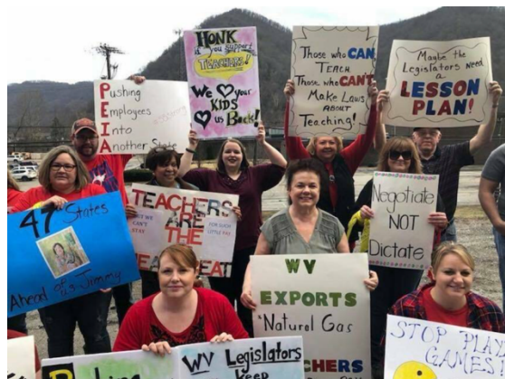
Figure 6: Teachers Hold Signs in a Group During the 2018 Strike 24

forms are extensions of our willfully waving arms and unruly tongues; they signal and stimulate our willingness to disobey, to go against the flow, to speak out and to get in the way of business as usual.” 22 In other words, these signs not only conveyed teachers’ demands, but in carrying them, teachers created an image of a unified front, a relentless resistance, and a “collective disposition [of] willfulness .” 23