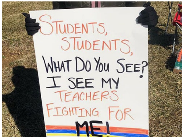
Figure 11: A Handmade Sign in the 2018 Strike 65

strike, “I’m excited, I’m thrilled, I feel like my life won’t ever be the same again. It sounds like hyperbole, but it’s not. Going back to my classroom won’t be the same now.” 64