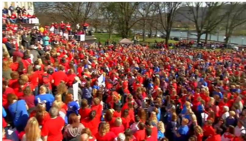
Figure 5: The Sea of Red on the Steps Outside the Capitol in 2018 20