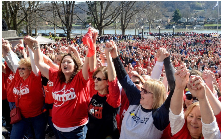
Figure 17: Women Teacher Strikers Hold Hands 43

building and by occupying their schoolyards, teachers physically put their bodies on the line, illustrating the existence and force of their political power. Further, this embodied gathering comprised femininized signs of affection not normally seen in strikes or other ‘claims to be political.’ For instance, see the image below.