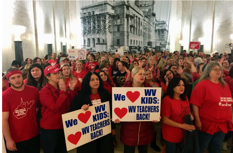
Figure 4: Teachers Wear Red Inside the State Capitol Building in 2018 19

In addition to the red t-shirts, every morning, local news channels would update viewers on the strike by showing a map of the state with each county on strike colored red. 18 Thus, every morning, the news channels would display a map of the state, entirely red, symbolizing that every county remained on strike—yet another visual representation of solidarity throughout the state, from the northernmost tip to the southern.