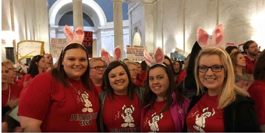
Figure 21: Teachers Wearing ‘Dumb Bunny’ Ears and Shirts 81