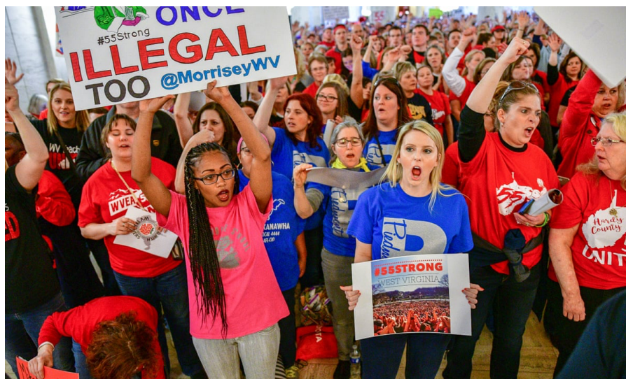
Figure 18: Women Teachers Shout their Demands 54