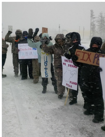
Figure 15: Teachers in Tucker County on Strike in a Snowstorm, March 2, 2018 33