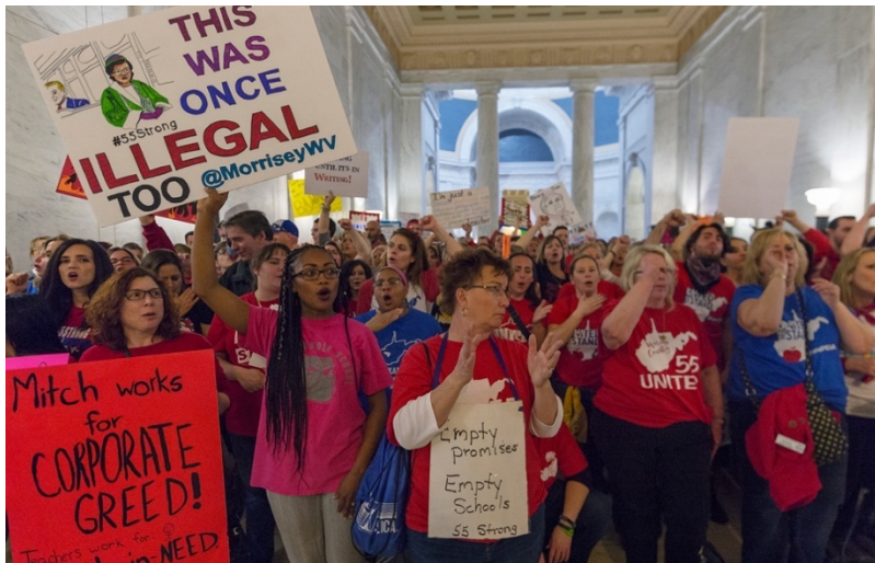
Figure 16: A Teacher’s Sign Speaks to Morrissey’s Threats 38

misogynistic policing mechanisms. Many of these instances were evidenced in Chapter Five, where I outlined the misogynistic language, tactics of shame, and other ‘down girl’ moves utilized again the West Virginia teachers. 37