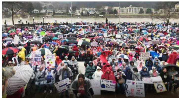
Figure 14: Thousands of Teachers Outside the Capitol in Cold and Rainy Conditions 32

The West Virginia teachers embraced their vulnerability in three ways. First, in the most basic sense, teachers risked the physical toll of inclement weather, such as rain, snow, and freezing temperatures. Even in such conditions, they protested in front of the capitol and alongside roads. This is evidenced by the two images that appear below.