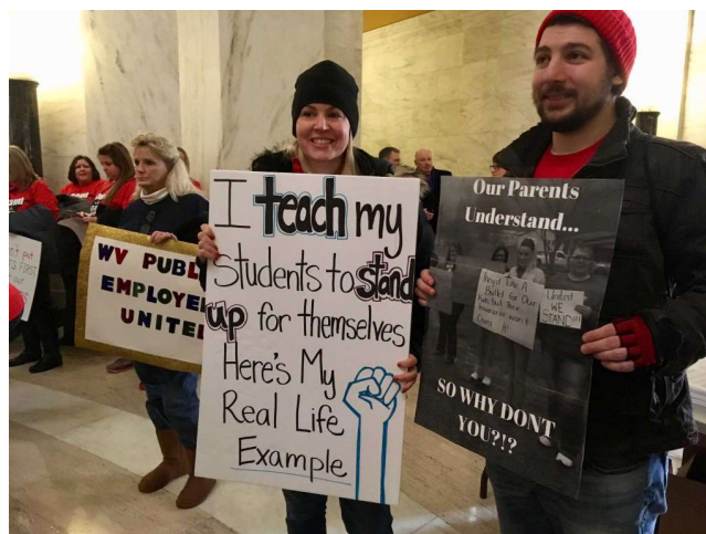
Figure 12: Teachers Hold Handmade Signs in the 2018 Strike 66

Many teachers recognized the political-aesthetic education they effected for others, particularly their students, through the performance of their strikes. Teachers recognized themselves on the picket line as role models for political action. This is evidenced from the two