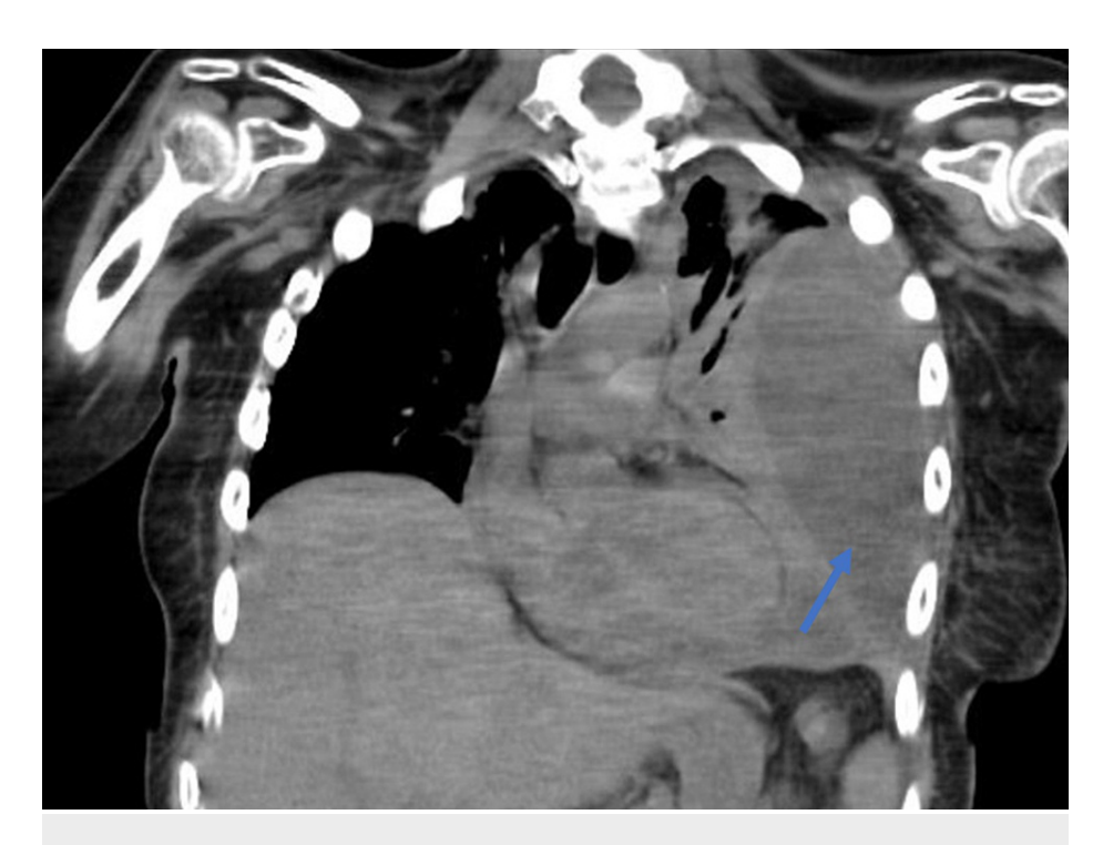
FIGURE 2: CT scan (coronal view) showing a left pulmonary empyema (blue arrow).

As C. rectus is implicated in chronic periodontitis and has rarely been found as an extraoral specimen, it was necessary to evaluate her oral health status to identify the route of infection.