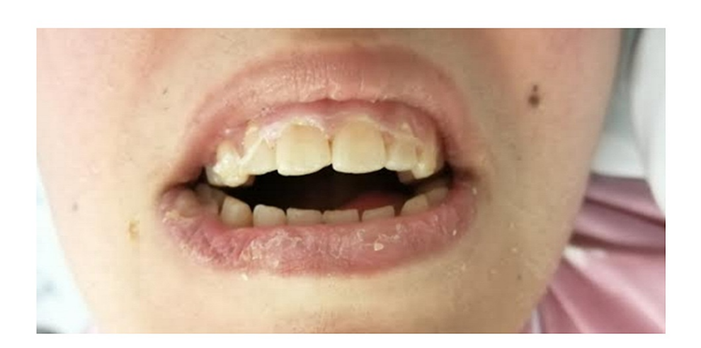
FIGURE 3: Photograph of the patient's mouth showing the patient's oral status. Dehydrated lips, poor oral hygiene, and dental plaque can be seen.

We were able to make an appropriate periodontal probing, finding pockets up to 6 mm, mainly in the posterior molar region. We also identified significant areas of gingival inflammation and bleeding, allowing us to make a clinical diagnosis of periodontal disease (stage III, grade A) (Figure 3).