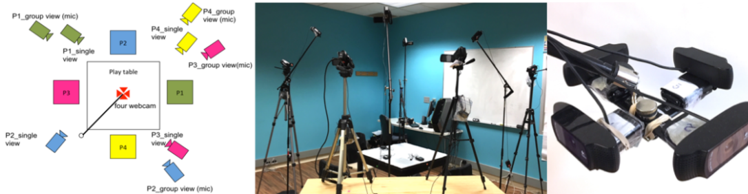
Fig. 2. In-lab study data collection apparatus. Left: equipment arrangement; Middle: real arrangement; Right: fixture of four Webcam devices.