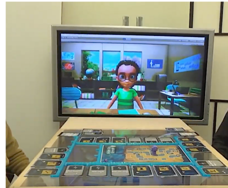
Fig. 5. Virtual peer interacts with the customized Outbreak board game.

We have developed a virtual peer that aims to elicit curiosity for young children in a collaborative tabletop game named Outbreak [82]. We applied heuristics derived from our theoretical framework of curiosity as described in this article and in [83], as well as our subsequent computational model of curiosity [81], [84]. The objective was to design social interactions for the virtual peer to perform for evoking key curiosity drives which lead to identification and acquisition of knowledge. First, we developed a virtual peer whose appearance resembles a 9-14 years old child with ambiguous gender and ethnicity (to avoid inadvertent gender and ethnicity stereotypes that might lead to stereotype threat for particular groups of students [85]). Figure 5 illustrates the virtual peer setup during a gameplay session.