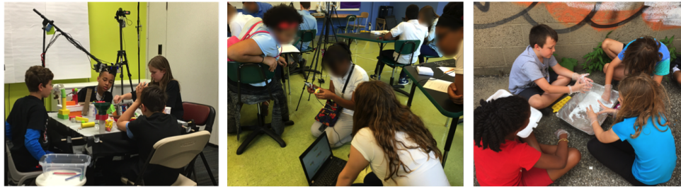
Fig. 1. Empirical observation across learning contexts. Left: in-lab RGM building; Middle: in-school STEAM class; Right: science summer camp