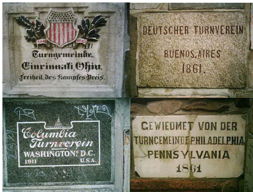
Figure 7. Plaques from Turner Associations around the world at the Jahndenkmal in Hasenheide Park in Berlin – Photo by Von Malud, CC BY-SA 3.0, https://commons.wikimedia.org/w/index.php?curid=6962726 .

Traveling through northern Germany, Rapp reminisced about his time in Berlin. The construction of the Reichstag building, the growth of the city and the new migrants had all transformed the city from a Prussian garrison town into a global metropolis. In the same letter, he also ruminated over visiting the Turnvater Jahn memorial in the Hasenheide Park south of Berlin, the place where Jahn founded the first Turner Society.