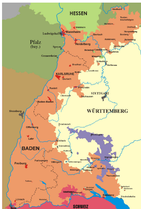
Figure 2. Map of the Grand Duchy of Baden, 1819-1945, ( https://upload.wikimedia.org/wikipedia/commons/b/bf/Map of Baden (1819-1945).png accessed April 2, 2021).

But Friedrich Wilhelm rejected the national assembly's crown. This refusal of Prussia to join the new political entity the national assembly sought to create signaled the ultimate failure of the revolution. Without either Prussia nor Austria, the rest of the German statelets could hardly hope to form a cohesive German country. Prussia recalled its representatives from the national assembly on May 14, 1849. The national assembly fell apart in the subsequent months, while smaller, localized revolutionary efforts like