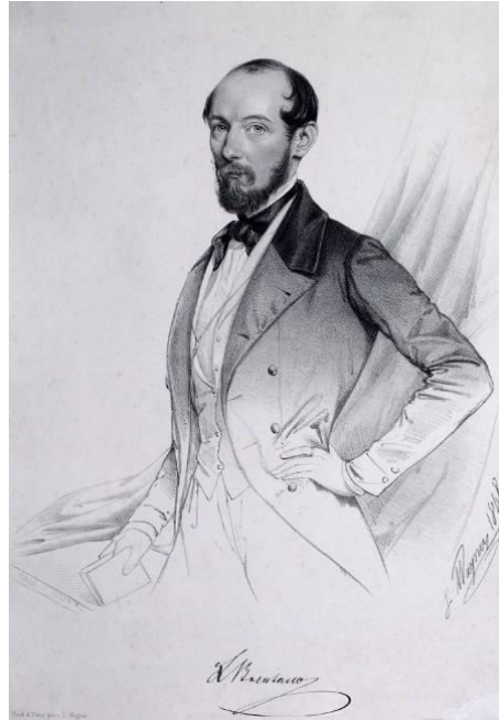
Figure 3. Ludwig Wagner - Lithographic Portrait Painting of Lorenz Brentano (1848). constitution instead of a noble sovereign, jury courts and equal access to education for all. 27 Hecker became one of the central figures in the Baden revolution. As a representative of the Baden government, he joined the Vorparlament in Frankfurt.

and were sometimes collectively referred to as the “March Program”: freedom of the press, freedom of assembly, members of the military swearing their oath towards the