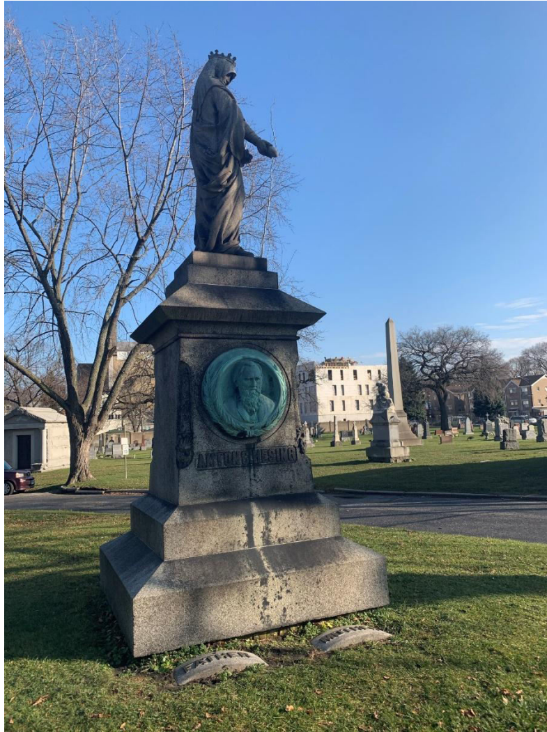
Figure 10. Gravesite of Anton C. Hesing's Family at St. Boniface Catholic Cemetery, Chicago (photograph by author, 2020).

disaster struck in the 1870s, first with the Great Chicago Fire and then the Panic of 1873, he succumbed to the rampant political corruption of the age, attempting to preserve his family's material well-being by questionable means. But in spite of this fall from grace, Anton Caspar Hesing was still regarded as ultimately an admirable figure, a pillar of