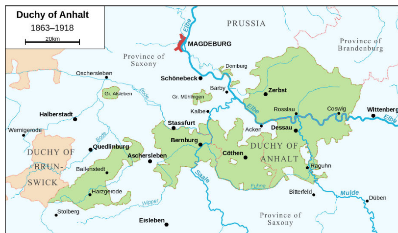
Figure 6. Map of Duchy of Anhalt, 1863-1918.