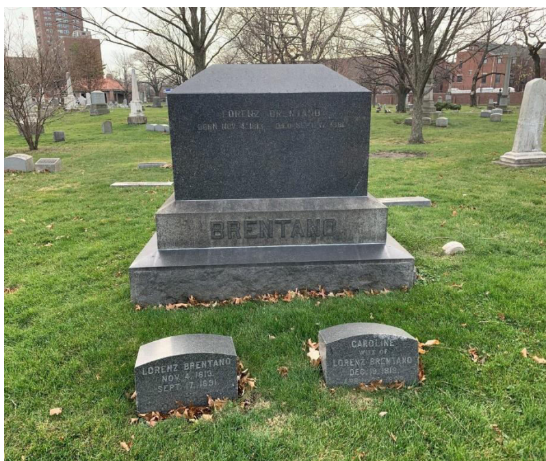
Figure 9. Gravesite of Lorenz Brentano and Family at Graceland Cemetery, Chicago.