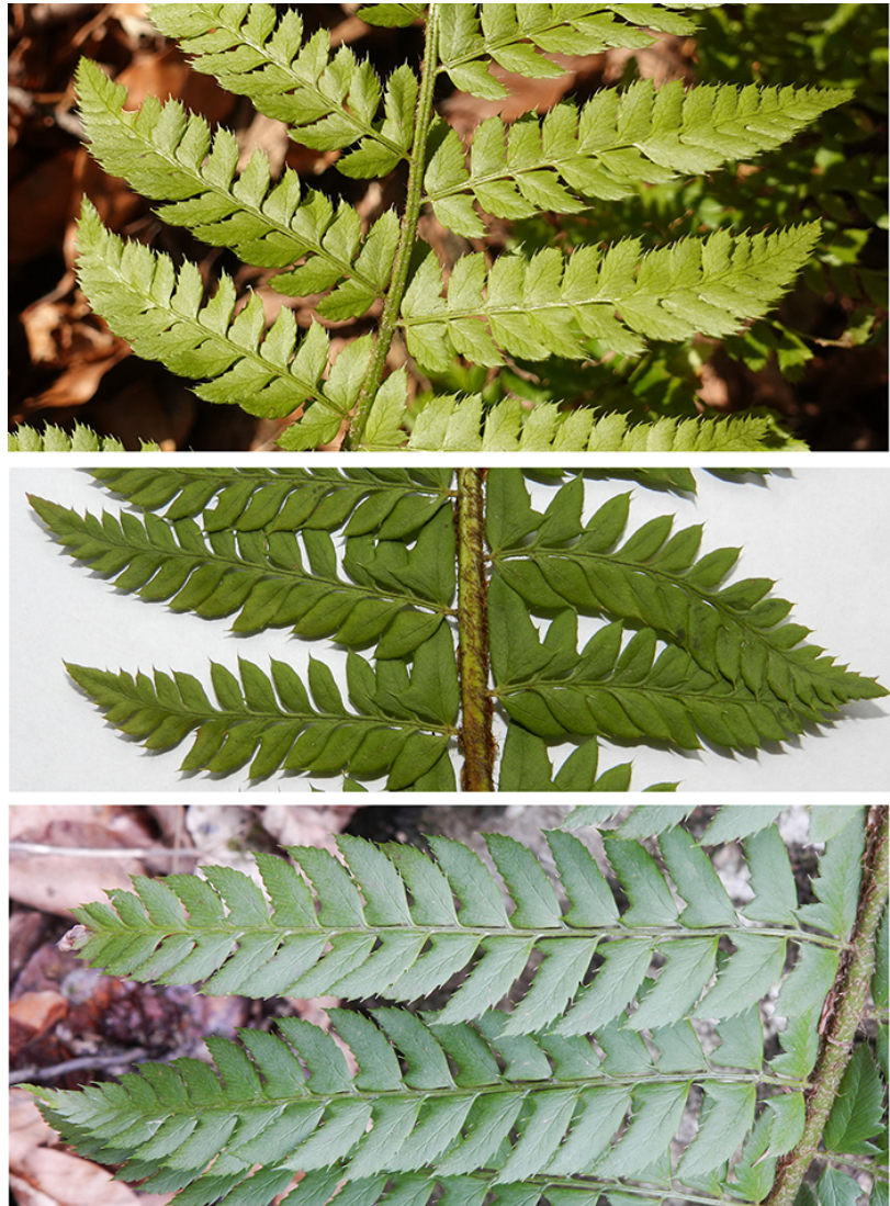
Figure 3 Leaf fragments of Polystichum setiferum (top) and P. aculeatum (middle) from Mt Czupel, as well as that of P. aculeatum var. aristatum Christ. (bottom) from Mt Jasieniowa in the Pogórze Cieszyńskie (Poland).

chopped leaves in a Petri dish with 1 mL of Galbraith's buffer (Galbraith et al., 1983) supplemented with propidium iodide (PI; 50 \mu\text{g cm}^{-3} ), ribonuclease A ( 50 \mu\text{g cm}^{-3} ), and 1% (v/v) polyvinylpyrrolidone (PVP). The suspension was passed through a 50- \mu\text{m} mesh nylon filter and analyzed using a CyFlow SL Green (Partec GmbH, Germany) flow cytometer equipped with a high-grade solid-state laser with green light emission at 532 nm, long-pass filter RG 590 E, DM 560 A, as well as side (SSC) and forward (FSC) scatters. Analyses were performed on three–four samples of each taxon. For each sample, the DNA content was established in 3,000–5,000 nuclei. Histograms were analyzed using the software FloMax (Partec GmbH). The coefficient of variation (CV) of the G_0/G_1 peak of Polystichum sp. ranged between 3.8% and 5.2%. Nuclear DNA content was calculated using the linear relationship between the ratio of the 2C peak positions Polystichum/Allium on a histogram of fluorescence intensities.