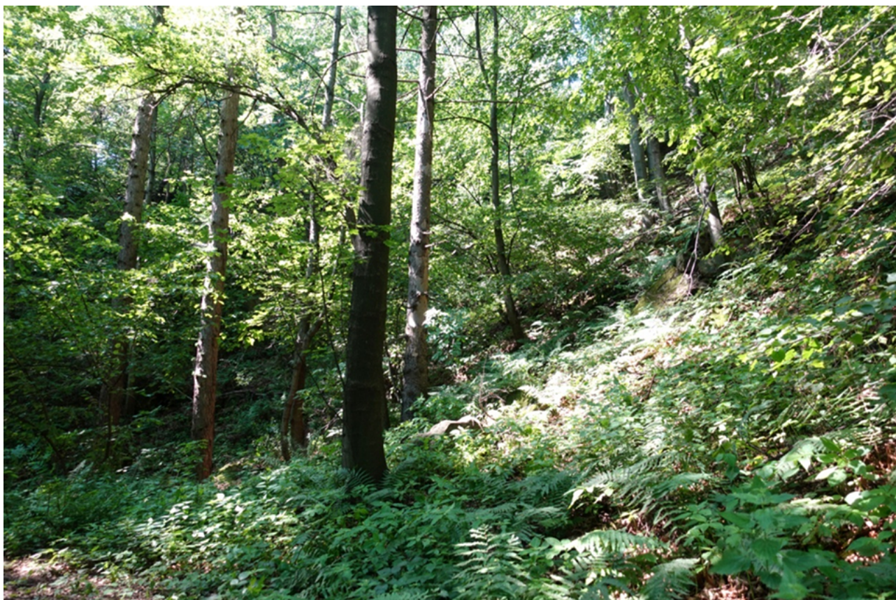
Figure 4 Habitat of Polystichum setiferum at Mt Czupel in the Beskid Śląski (Poland) (photo by D. Tlalka, July 7, 2020).

December 21, 2019, on the southwestern slopes of Mt Czupel near Brenna, in the western part of the Beskid Śląski mountain range, in one of the abandoned sandstone quarries at ca. 480 m a.s.l. (ATPOL DG0201 square), covered with a 100-year-old beech forest with an admixture of artificially planted larch trees in a half-shaded habitat (Figure 4). This plant was accompanied by several individuals of P. aculeatum located further apart.