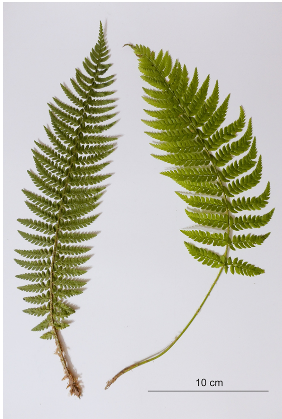
Figure 2 Leaves of Polystichum setiferum (right) from Mt Czupel in the Beskid Śląski and P. aculeatum (left) from the Soła Valley in Kobiernice in the Pogórze Śląskie (Poland).

Herbarium studies were performed at the herbaria of the Jagiellonian University (KRA) and the Institute of Botany, Polish Academy of Sciences (KRAM).