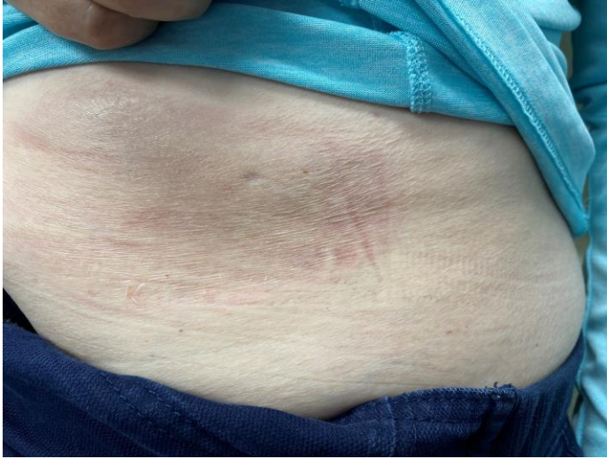
Figure 4. Interstitial granulomatous dermatitis of the left abdomen with a notable reduction in erythema and plaque size after initiation of chemotherapy.

Features shared by these once-considered unique processes has led to the use of the unifying term, whereas more classic presentations have been considered subtypes, such as RGD, IGD type [1].