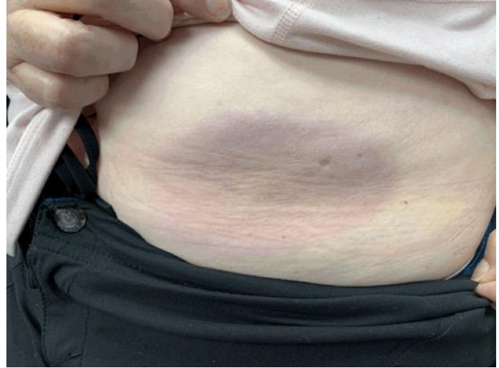
Figure 3. Interstitial granulomatous dermatitis as a round, indurated lilac-erythematous plaque on the left abdomen eight months prior to diagnosis of ovarian cancer.

No new lesions developed and she remained asymptomatic. Physical examination findings were unchanged from the initial visit. The patient remained on topical corticosteroids with persistence of cutaneous findings.