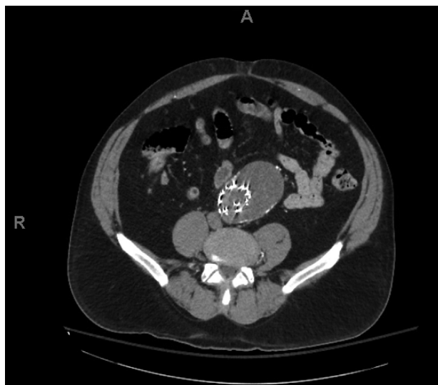
Fig 2. Axial section of a computed tomography angiogram showing a thrombosed Endologix aortic stent graft with a sacular abdominal aneurysm measuring 6.0 × 5.1 × 4.4 cm from the 12- to 3-o'clock position.

infrarenal aorta was clamped, and the sac was cleared. The aortic portion of the EVAR stent graft was explanted, which had a large thrombus within the lumen (Fig 3). The bilateral iliac