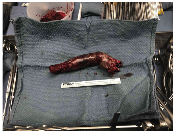
Fig 3. Explanted Endologix aortic stent graft showing kinked deformation. Top left corner, a bucket containing mural thrombosis that had been inside the aneurysm.

infrarenal aorta was clamped, and the sac was cleared. The aortic portion of the EVAR stent graft was explanted, which had a large thrombus within the lumen (Fig 3). The bilateral iliac