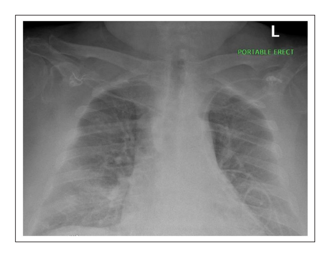
Figure 2. The chest X-ray showed multifocal bilateral patchy interstitial and alveolar infiltrates. No pneumothorax was present. Findings were consistent with multifocal bronchiolitis pneumonia consistent with the history of COVID-19 pneumonia.

Initially, the patient was treated with one dose of dexamethasone 10 mg IV push and bamlanivamab and etesevimab. However, upon ICU transfer, the patient was started on methylprednisolone 1 g for 3 days per our ICU COVID-19 protocol. Originally, remdesivir and tocilizumab were