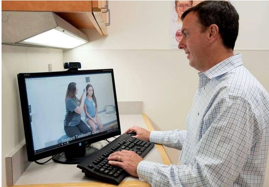
FIGURE 1 | Medical assistant telemedicine in use. A physician provider to the far right is watching the medical assistant at the far left on the screen using a device to examine the ear of a patient. The device will relay images of the patient's ear exam to the physician.