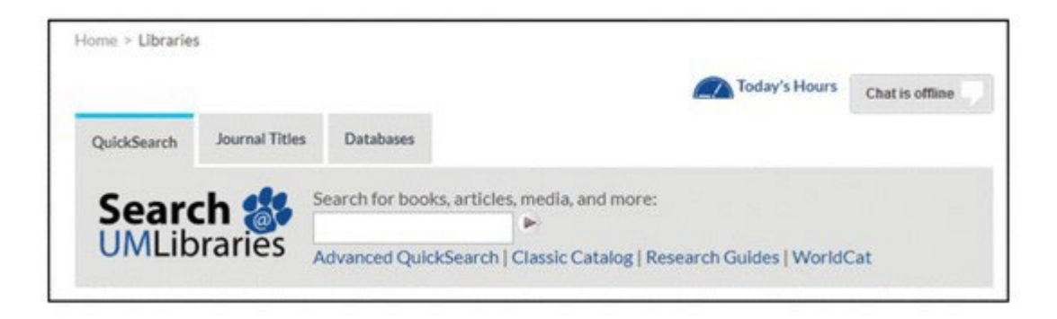
Figure 1 Tabbed Search Box

The first case study involves the discovery of e-resources via the library's homepage. The University of Memphis had long used a tabbed search box with a default setting that pulled both from the library's discovery layer and traditional catalog. There were separate tabs to search journals and databases, and both of those tabs also included specialized services and resources. Figure 1 presents the tabbed search box on which we conducted usability testing.