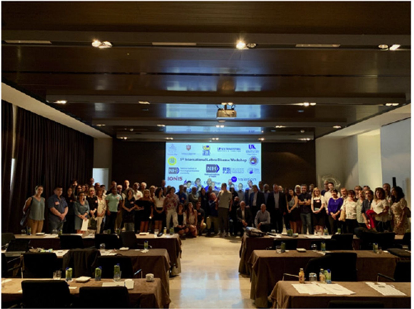
Fig. 2. Over 100 scientists, clinicians, and family and friends of patients with LD attended the 5th International Lafora Disease Workshop.