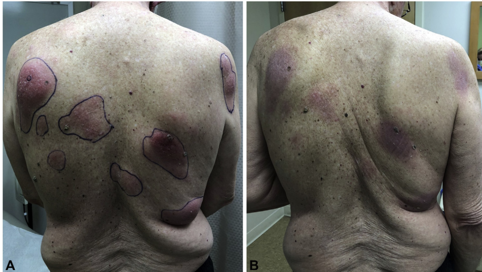
Fig 2. Multiple pink, indurated plaques and nodules before (A) and after (B) treatment with the mTOR inhibitor TAK-228.

survival rate of 20%. 7 Aberrant CD20 expression in cutaneous T-cell lymphomas is uncommon. 8 In our case, the anti-CD20 monoclonal antibody rituximab was attempted for 2 months; however, there was no significant response.