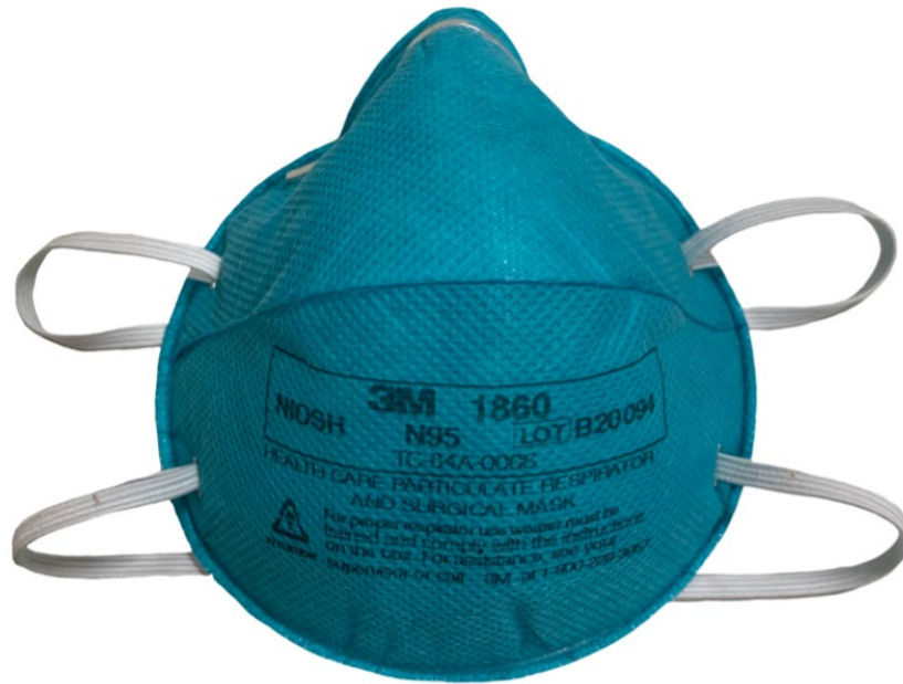
Figure 1: 3M™ (Saint Paul, Minnesota, USA) Health Care Particulate Respirator and Surgical Mask 1860, N95 120 EA/Case.

Additionally, in Spain, 72% of infected healthcare workers were female (5,265) and in Italy 66% of infected healthcare workers were female (10,657). Similar trends were found in the USA, with the CDC reporting 73% of infected healthcare workers were female. 20 Therefore, it is important to ensure proper N95 fit for all healthcare workers, including females, since they make up the majority of the healthcare workforce.