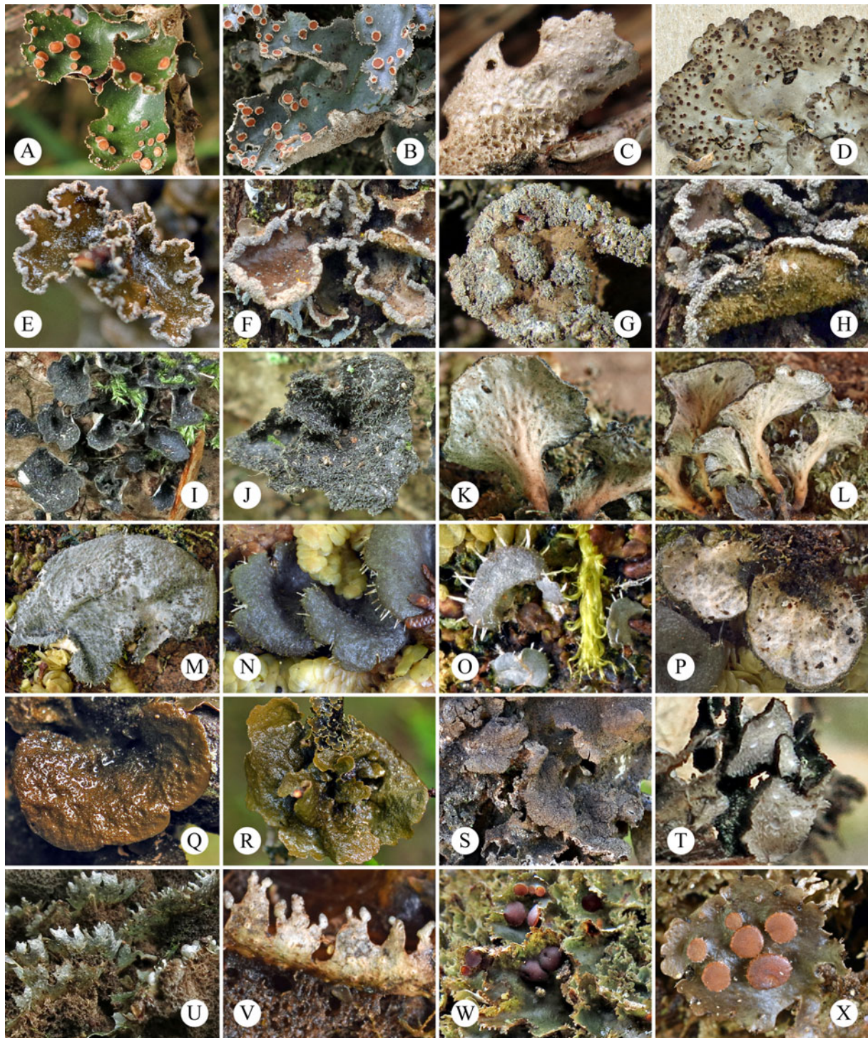
Fig. 1. Habitus of Hawaiian Sticta . A–D, S. tomentosa . E–H, S. limbata . I–L, S. acyphellata . M–P, S. hawaiiensis . Q–T, S. fuliginosa . U–X, S. antoniana . Most of these images were taken in the field, therefore no scales are added. Sticta antoniana , S. fuliginosa , S. limbata and S. tomentosa are conspicuous species, whereas S. acyphellata and S. hawaiiensis are comparatively small, their individual thalli usually not exceeding 1 cm. In colour online.