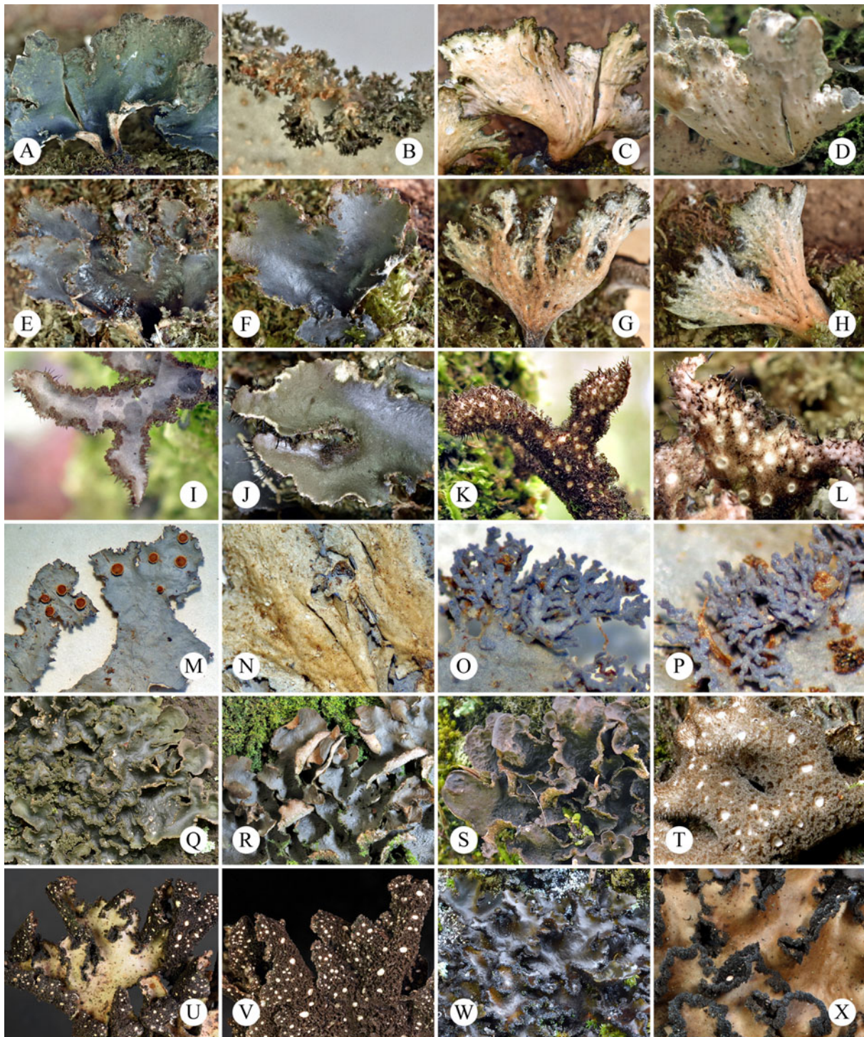
Fig. 2. Habitus of Hawaiian Sticta . A–D, S. flynnii . E–H, S. smithii . I–L, S. emmanueliana . M–P, S. plumbicolor . Q–T, S. scabrosa subsp. hawaiiensis . U–V, S. waikamoi . W–X, S. andina . Most of these images were taken in the field, therefore no scales are added. Sticta andina , S. fuliginosa , S. plumbicolor , S. scabrosa subsp. hawaiiensis and S. waikamoi are conspicuous to large taxa, whereas S. flynnii and S. smithii are comparatively small, their individual thalli usually not exceeding 1 cm; S. emmanueliana is intermediate in size. In colour online.

plane to involute, their margins becoming dissected. Upper surface even, dark bluish grey when fresh, bluish grey when dry, glabrous, without papillae or pruina, with white maculae forming a reticulate pattern. Isidia frequent, marginal and laminal, 0.1–0.2 mm long and 0.05–0.1 mm broad, dark grey, shiny, flattened and somewhat imbricate, becoming somewhat arbuscular,