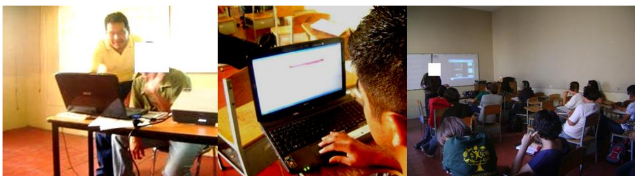
Figure 2. Training teacher and students who participated as digital migrants, and projection of the blog in the classroom

As part of the action plan and the implementation phase, the subject's syllabus was revised, the blog and its learning tasks were designed, the teacher and the digital migrant students were trained (see figure 2) to access the blog and exploit it for the subject's purpose. The blog web address is http://apreciacionmusical.blogspot.mx/ (Zapata et al. , 2014).