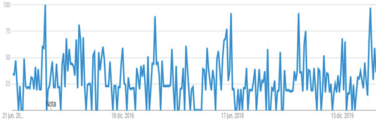
Figure 2. Interest about "Afghanistan War" in Spain by Google Trends .

in which the attack on the Spanish Embassy occurred in Kabul. As the scientific literature marks, Google Trends is not a valid tool for cybermetrics analysis (Orduño-Malea, 2013) but allows to yield relative data on the behavior of audiences.