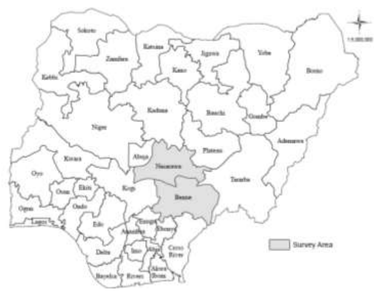
Figure 1: Sample states