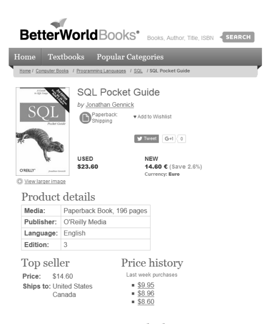
Figure 1: A sample document.