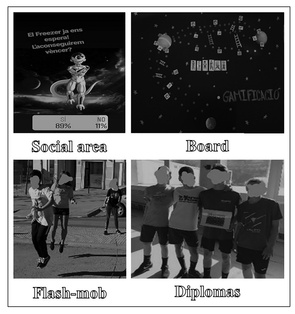
Figure 2. Some examples of the basic elements of gamification.

the research team. The process was based on Goodyear's (2017) continuous professional development, where the research team provided support and supervised the implementation.