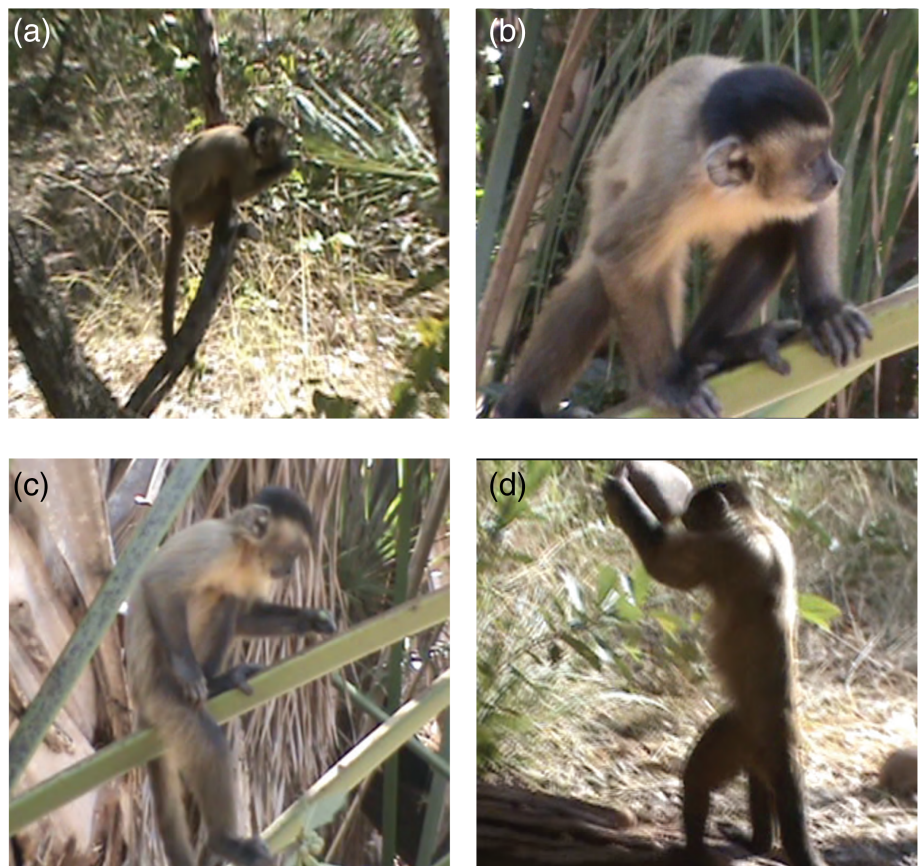
FIGURE 1 Images captured from the videos showing bearded capuchins ( Sapajus libidinosus ) in (a) squat, (b) forelimb crouch, (c) sit-in/sit-out, and (d) flexed bipedal stand postures

type of feeding behavior, the location of food placement within the mouth, and the amount of bite force (e.g., Herring & Herring, 1974; Laird, Granatosky, et al., 2020; Lucas, 2004; Perry et al., 2011; Wright, 2005). Studies of primate FMPs have focused on two measures: food toughness and elastic modulus. Toughness is defined in this context as the work needed to propagate a crack through an object, whereas elastic modulus (or stiffness) is the relationship between stress and strain within the elastic region of an object (Ashby, 2002; Lucas, 2004).