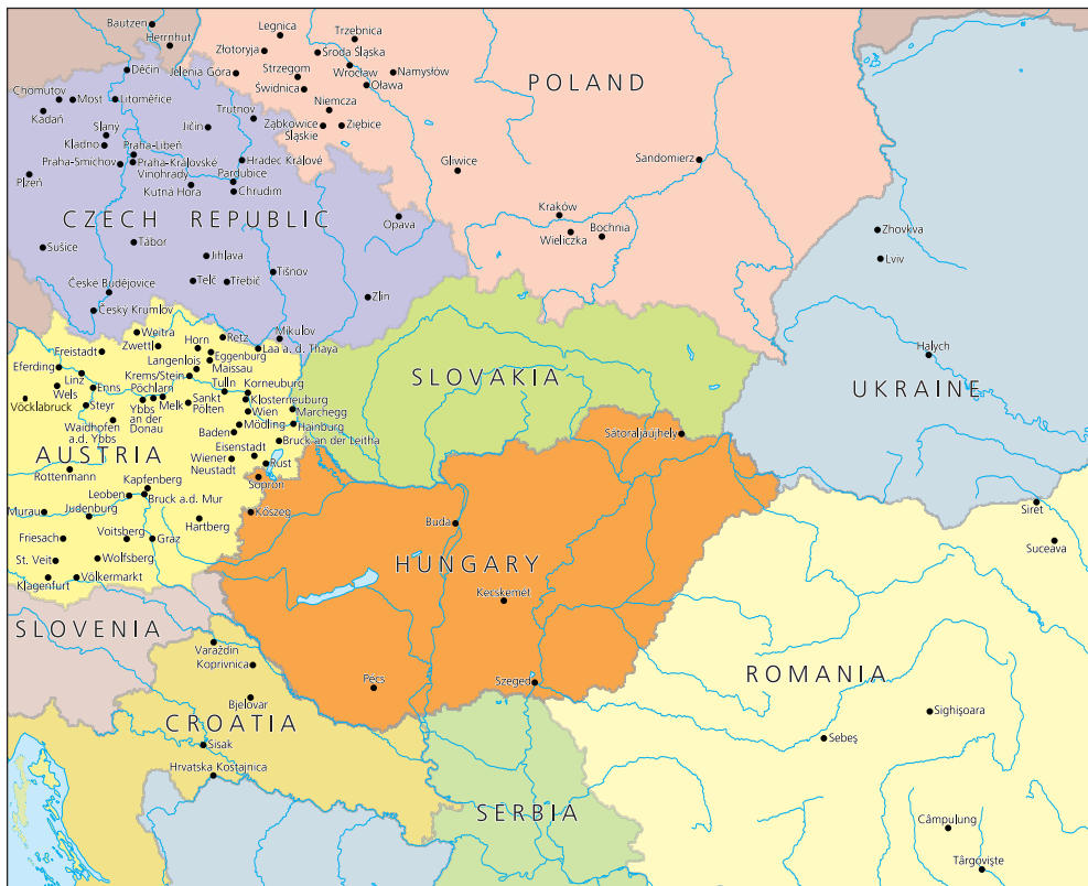
Figure 1 Historic Towns Atlases published in East Central Europe up to August 2021. Cartography: Béla Nagy.

After 2000, further East Central European countries, namely Romania (2000), Croatia (2005), Hungary (2010) and Ukraine (2014), joined in. Plans are in place to launch the atlas series in Slovakia and Slovenia as well, both of which would fill long-standing research gaps (Fig. 1). 13 In this region, the issue of changing political borders is even more complex than elsewhere in Europe. The adherence to the current borders is an acceptable compromise; however, due to the specificities of the source material and the pertaining historical research, more cross-border cooperation in the editorial work on the atlases would be desirable and justified. All East Central European atlas series—unlike those in Western Europe—publish the topographic study and the captions to all illustrations in bilingual form, adding German or English translation to the local vernaculars.