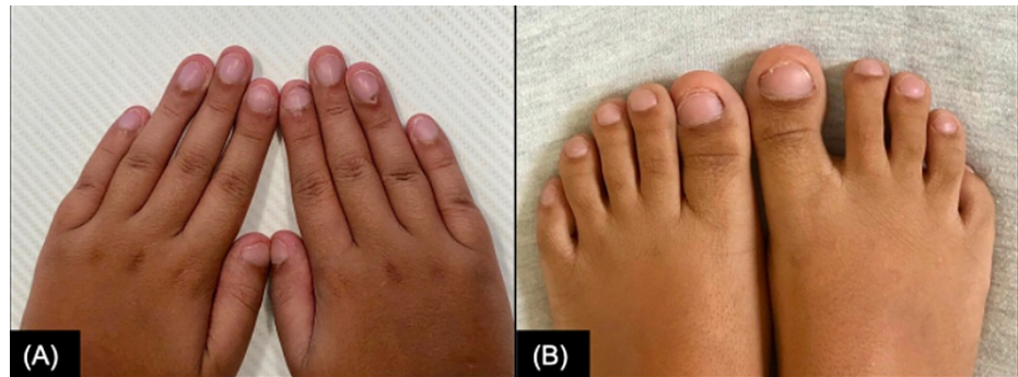
FIGURE 1: Generalized digital clubbing.

Unit (PICU) admissions and two endotracheal intubations. Two weeks prior to our initial encounter, the patient was admitted to the PICU for four days due to an acute episode of shortness of breath and associated chest pain with hypoxemia. On initial presentation to our clinic, the patient required 24-hour oxygen supplementation via nasal cannula at 2 L per minute (LPM). Pulse oximetry was 92-95% with a nasal cannula on rest and decreased to 80-85% on room air with physical activity. Physical examination demonstrated a chronically ill-appearing 13-year-old boy with a heart rate of 114 beats per minute, respiratory rate of 25 breaths per minute, oxygen saturation of 92% at 2 LPM, body mass index of 18.16 (45th percentile), generalized digital clubbing of both upper and lower extremities (Figure 1), and lungs clear to auscultation bilaterally.