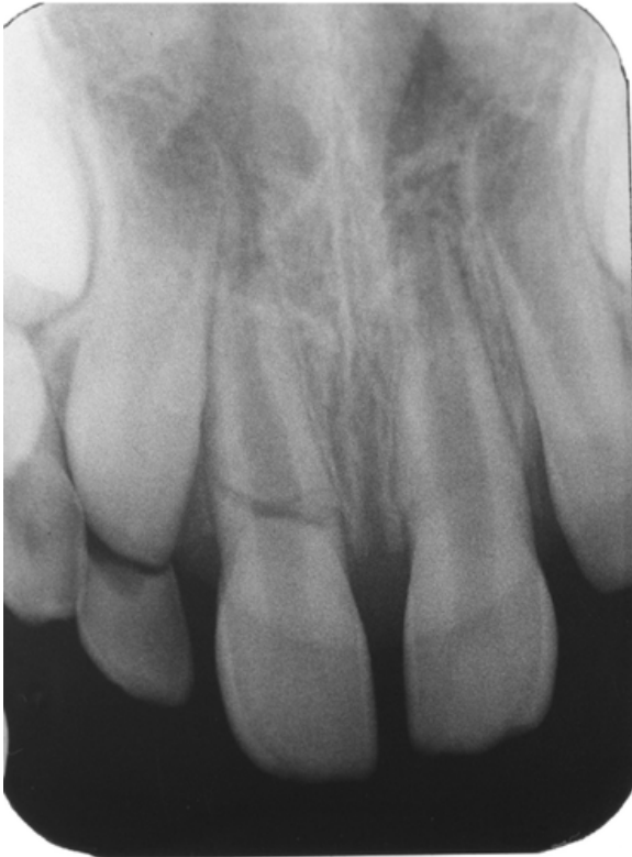
Figure 1 Baseline Radiograph Showing Horizontal Root Fracture on #11

On clinical examination, slight mobility of tooth #11 and tenderness to percussion and palpation were noted. She had a delayed response to cold and electrical vitality tests. Radiographic examination revealed a horizontal root fracture of #11 with incomplete maturogenesis (Figure 1). It was also observed that the diastasis between fragments were minimum and the coronal fragment was not excessively dislocated. A diagnosis of cervical-mid-root fracture was made.