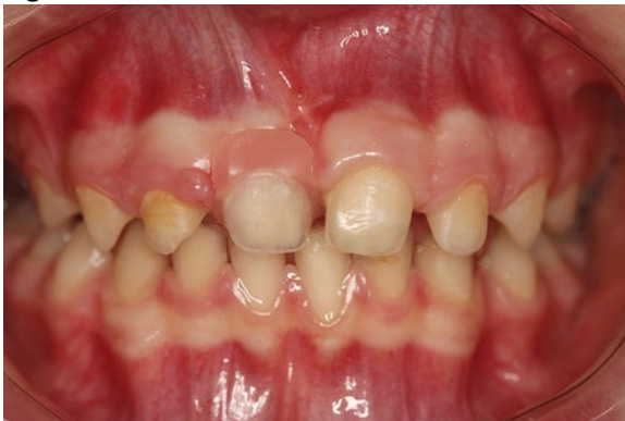
Figure 4 Intraoral Photo at 5 years