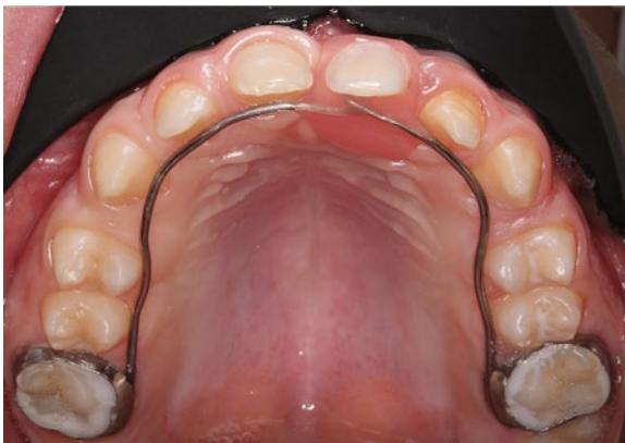
Figure 3 Intraoral Photo from Occlusal View at 5 years

On a hard plaster model, the extracted crown was reduced to fit. The coronal dentin was removed to approximately 1 mm from the dentinoenamel junction using a high-speed air turbine with water cooling. A modification to Nance appliance was made by bending a round loop over the extraction site for acrylic retention. To copolymerize it with the pink denture resin (Dentaurum, Pforzheim, Germany), the crown was prepared with a microfilled hybrid resin composite material (Spectrum TPH, Shade B2, Dentsply, Konstanz, Germany) using an etch-and-rinse adhesive (Prime&Bond NT, Dentsply, Konstanz, Germany). Following pressurized polymerization, the appliance was removed from the model and roughly polished. After satisfactory try-in and fine polishing, the appliance was cemented with glass ionomer cement (Figures 3 and 4). Suggestions regarding good oral hygiene practices were given and the patient was recalled at 3-month intervals. During these visits, it was noted that the seizures were taking place less than once in a month. Her medications included clobazam in addition to levetiracetam and sodium valproate. The patient seemed to be highly satisfied with the esthetic and functional outcome and reported no discomfort with the use of the appliance. Radiographic examination, at 5-year, displayed healthy alveolar bone surrounding the submerged root (Figure 5).