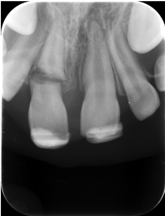
Figure 2 Radiograph Showing Extrusion of Coronal Fragment at 20 Months

During a seizure at 16 months, the patient sustained another trauma to her tooth which resulted in complete detachment of the splint. A new splint was made. Another seizure, at 20 months, resulted in the extrusion of the coronal fragment (Figure 2). The tooth was partially attached to the palatal gingiva and became extremely mobile. Treatment alternatives were discussed with the parent: (1) Repositioning of the coronal segment and splinting. (2) Extraction of both apical and coronal fragments. (3) Extraction of only coronal fragment and keeping apical fragment in situ following proper pulp coverage. Repositioning of the coronal segment was not accepted by the parent. However, after explaining the benefit of keeping apical fragment on preserving alveolar bone growth, the parent consented on the third option.