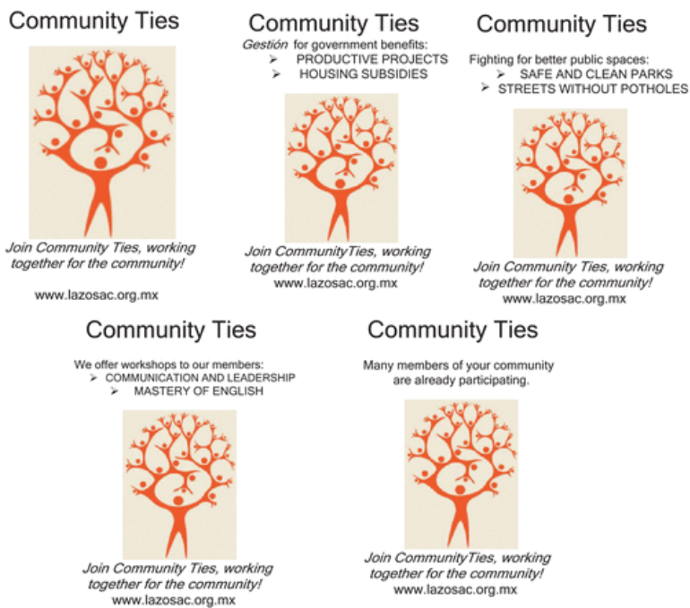
Figure 2. Control and treatment conditions.

The control version of the flier (top left of Figure 2) contained only the organization’s name, slogan (“Join Community Ties, Working Together for the Community!”), fictitious website, and logo. The four treatment conditions included these same elements with additional messages.