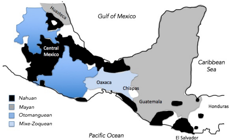
Figure 2. Approximate distribution of major Mesoamerican language families at the time of Eurasian contact. Given the extent of migration, trade, and diplomacy as well as the reach of the Aztec empire, this map is an oversimplification and leaves out many other languages such as Totonacan, Xinka, and non-Nahuan languages of the Uto-Aztecan branch.

When the Spanish arrived in 1519, central Mexico was the most urbanized, politically powerful, and densely populated part of Mesoamerica. The Spanish made the defeated Aztec capital of Tenochtitlan the bureaucratic heart of their own nascent empire, and engaged Indigenous intellectuals in a remarkable, sometimes violent merging of Mesoamerican and European writing systems [McDonough 2014] [Townsend 2016]. This produced a significant amount and variety of Nahuatl written in Roman script that has been studied extensively, for centuries in Mexico and more recently in the United States and Europe.